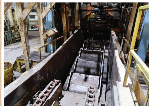
HYDRAULIC OPERATED 3-STEP FEEDER