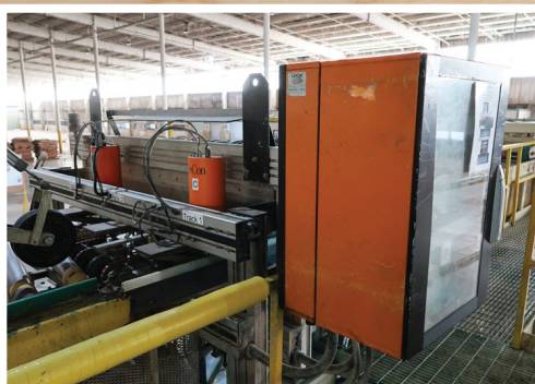
GRECON TWIN DMR 2000 VENEER THICKNESS STATION