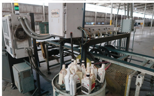
(3) VENTEK SEQUOIA II DRY VENEER MOISTURE DETECTORS