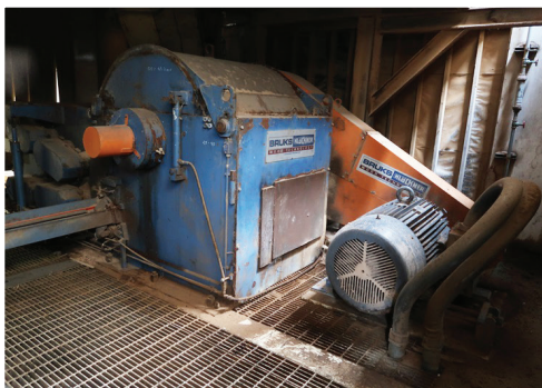
2006 BROOKS KLOCKNER BK-DH400X1000L-8W VENEER DRUM CHIPPER