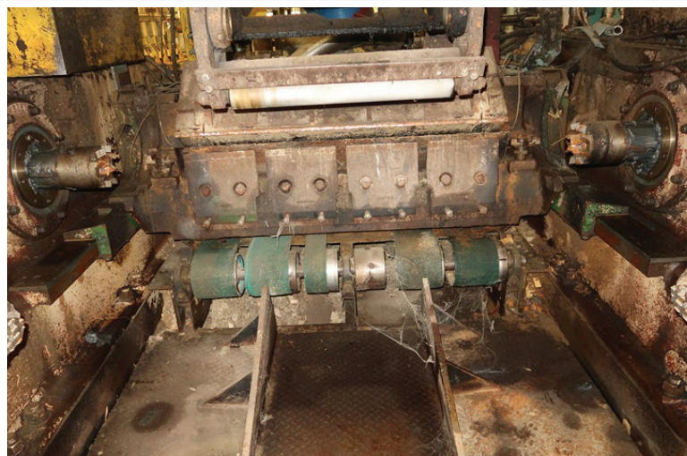
COE 277 56" VENEER LATHE W/2010 SMART SCAN UPGRADE