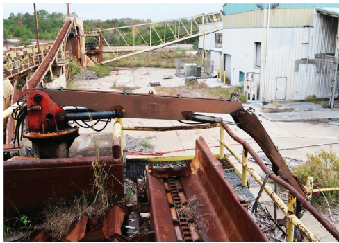
BARKO STATIONARY LOG LOADER W/ROTOBEC 4642B ROTARY GRAPPLE