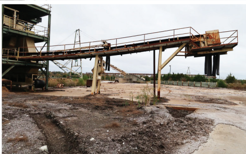
APPROX 30" X 85' COVERED TROUGHING BELT