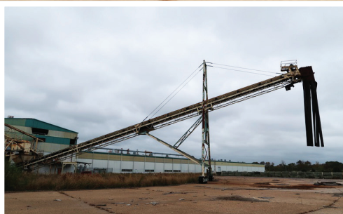
APPROX 36" X 160' RADIAL STACKER