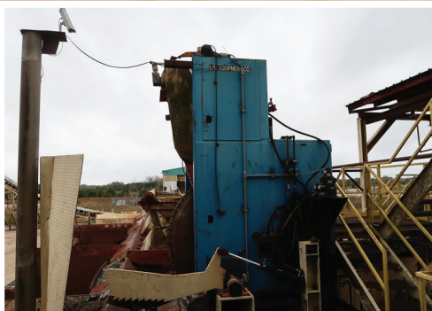
1999 L&M 84" MODEL SWING SAW RH W/INSERT TOOTH SAW