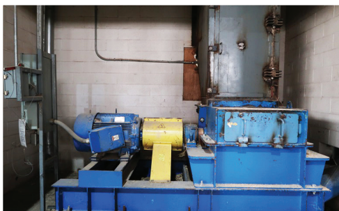
WILLIAMS PATENT CRUSHER & PULVERIZER C-32 NO-KNIFE HOG MILL