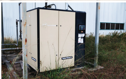
2012 INGERSOLL RAND IRN100H-CC ROTARY SCREW COMPRESSOR