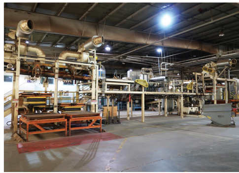
CTC VENEER MATCHING LINE