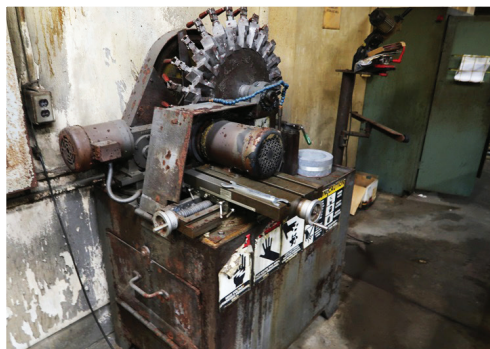
ARASMITH LILY PAD CHIPPER KNIFE GRINDER