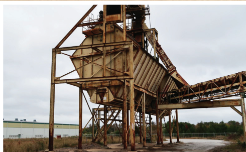
(2) APPROX 80-UNIT HYDRAULIC OPERATED MONO CHIP BINS