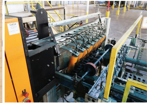
GRECON TWIN UPU 2000 VENEER BOND ANALYZER