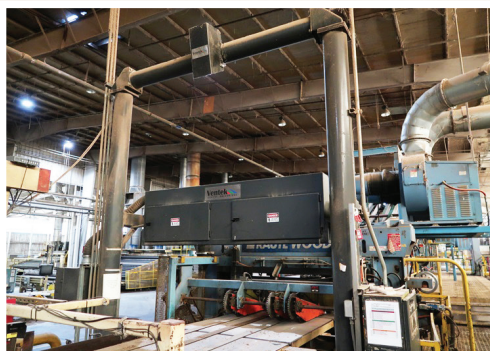
VENTEK NV2000 8' GREEN VENEER LASER DEFECT SCANNER