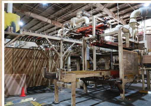
2005 CTE SEMI-AUTO HI-OUTPUT LAYUP LINE