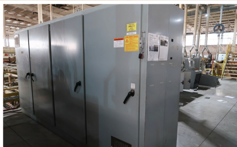
2005 ALLEN BRADLEY 4-SECTION 2-SIDED CABINETS