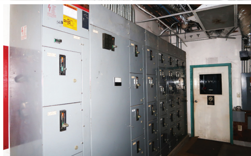
MAINS & MCC'S