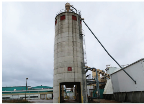
2009 LAIDIG S243 24' DIA CONCRETE DUST SILO W/ RECLAIM & DISCHARGE AUGERS