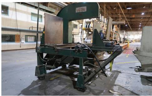
SWEED VENCO 8' VENEER BANDSAW