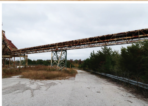
APPROX 42" X 250' COVERED TROUGHING BELT