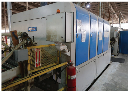
2005 TAGLIABUE EUROSAND 1111SP 64" TOP HEAD SANDER