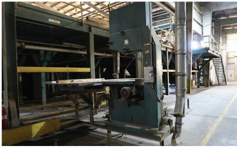
1994 SCMI 900SC 36" VENEER BANDSAW