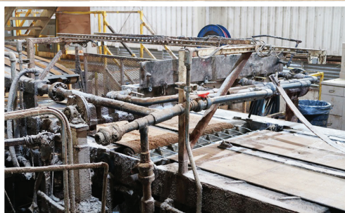
2005 KOCH 160Y 63" CURTAIN COATER