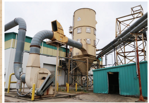
2005 LIGNA-CON FILTER 14.5-500-452-12 CONTINUOUS REVERSE AIR CLEANING SYSTEM