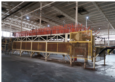
2005 CTC BOARD WICKET COOLER