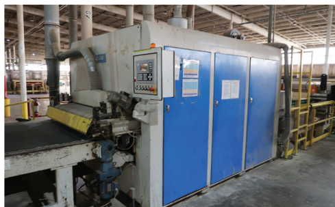
2005 TAGLIABUE EUROSAND 1111SP 64" BOTTOM HEAD SANDER