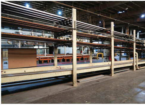
APPROX 100' 3-DECK VENEER TRAYS