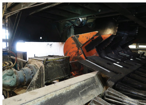
BLOCK SAW SYSTEM