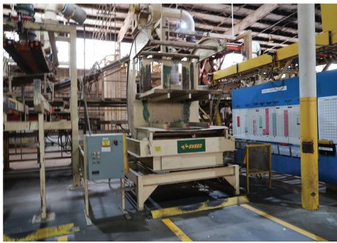
SWEED RL-TC PANEL TURNER