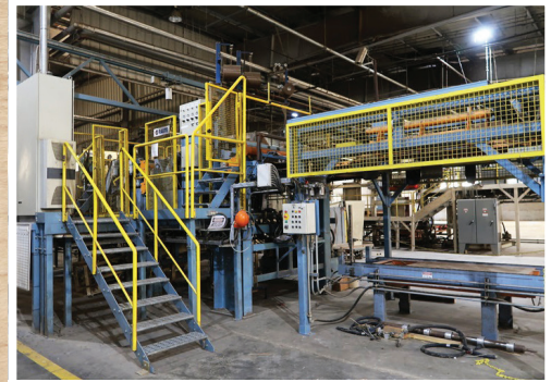
(2) RAUTE C1400/C1100 VENEER COMPOSER LINES