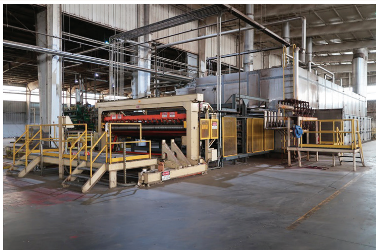
2005 COE 72 VERT-A-JET STEAM HEATED VENEER DRYER

Location: 785 Port Of Epes Hwy, Epes, AL 35460