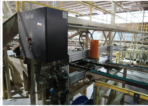
GRECON SINGLE DMR 2000 VENEER THICKNESS STATION