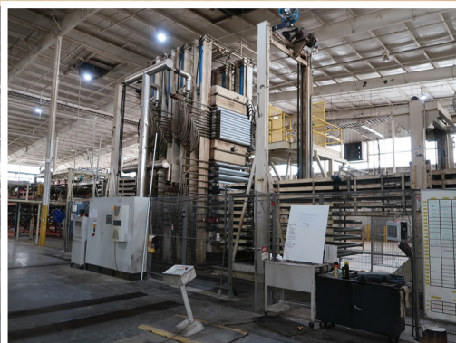
2005 BURKLE OPTIMA DOUBLE 10-OPENING HOT OIL PRESS