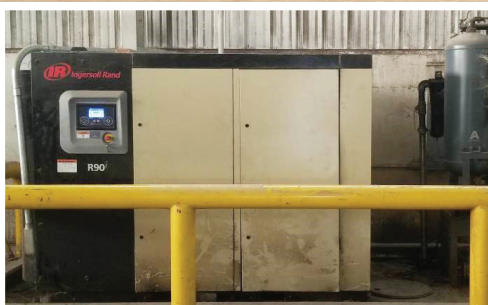
INGERSOLL RAND R901 ROTARY SCREW COMPRESSOR