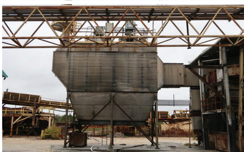
2000 PPC H1212-2S ELECTROSTATIC PRECIPITATOR

1991 COE M72/92 VERT-A-JET STEAM HEATED VENEER DRYER, 14' 12-SECTION, 4-TRAYS, 168" ROLLS, (1) DRAFT COOLING SECTION W/APPROX 25 HP MOTOR, 25 HP TRAY DRIVE MOTORS, (12) APPROX 30 HP SECTION FAN MOTORS, SWEED ACCUMATIC/ECONOVAC 1200AA 14' VACUUM FEEDER, APPROX 20 HP BLOWER, (1) 15 HP & (2) 5 HP HYDRAULIC UNITS, YASKAWA VFD'S, 21' 3-STRAND 81X ELEVATOR INFEED TRANSFER, 20' 3-STRAND 81X PRE-FEED TRANSFER, COE 14' 4-TRAY UNLOADER W/7-1/2 HP HYDRAULIC UNIT, 17' 4-STRAND APRON BELT W/ABB VFD TO POWERED PINCH ROLL W/ABB VFD TO 16' 3-STRAND C155D OUTFEED TRANSFER W/ABB VFD, CONTROLS & ELECTRICS