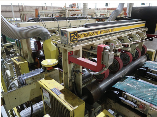
2005 PROGRESSIVE SYSTEMS INC. RF-40 2-SAW SIZING LINE