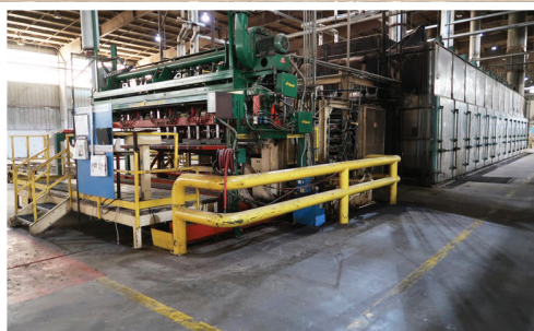
1991 COE M72/92 VERT-A-JET STEAM HEATED VENEER DRYER