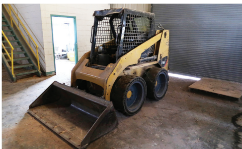
2008 CAT 216B2 SKID STEER