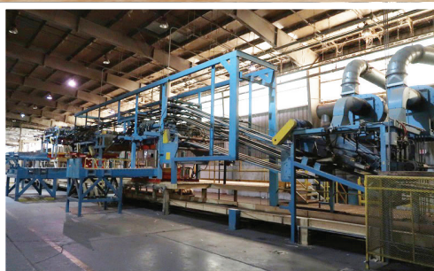
2002 RAUTE WOOD 4-BIN GREEN VENEER STACKER