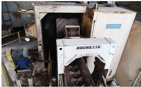
1991 VALON KONE MKV-35C 35" 6-ARM RING DEBARKER