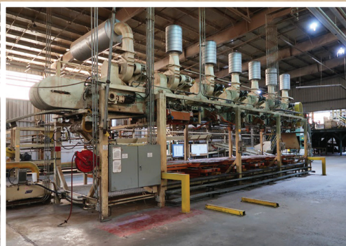
2002 CTE AUTOMATIC 6-BIN DRY VENEER STACKER