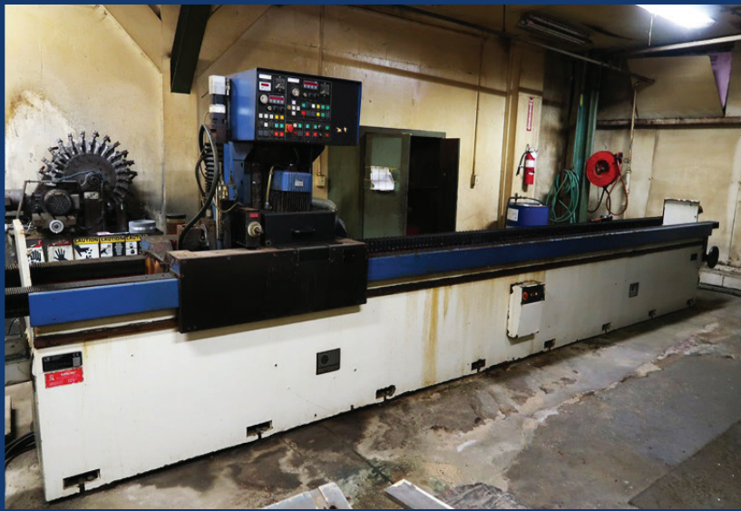
2007 REFORM TYPE 61AR31 TRAVEL BED KNIFE GRINDER

START DATE: 11:00 AM | THURSDAY - FEBRUARY 18 END DATE: 11:00 AM | THURSDAY - FEBRUARY 25