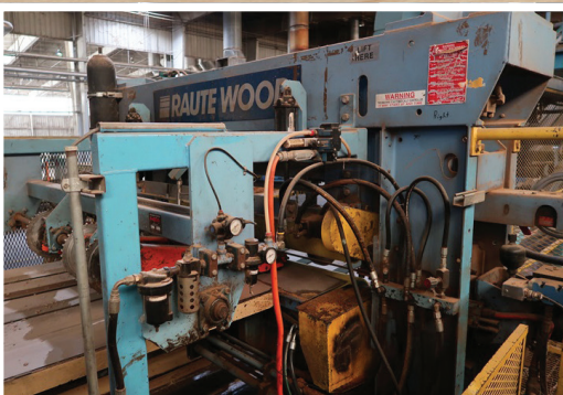
2002 RAUTE 6' ROTARY CLIPPER