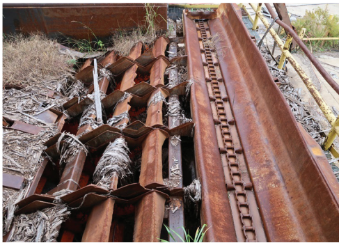
20' HYDRAULIC OPERATED 3-STEP LOG FEEDER