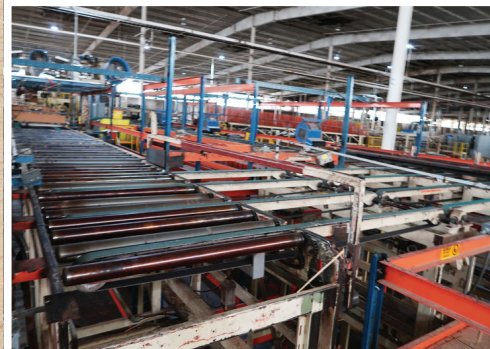
2011 PUTTY PATCH LINE