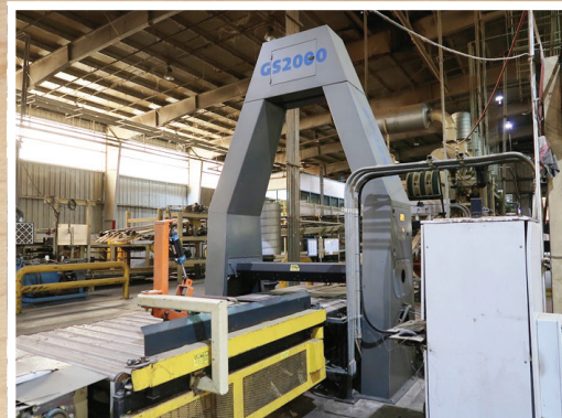
2002 VENTEK GS2000 DRY END VENEER SCANNER