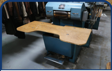
RELIABLE MACHINE WKS 25