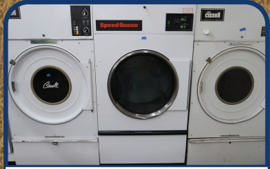
SPEED QUEEN ST050EQTF5G2W02