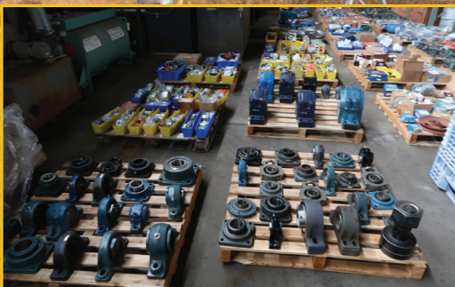
LARGE ASSORTMENT OF BEARINGS