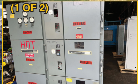
ALLEN BRADLEY CENTERLINE-HVC