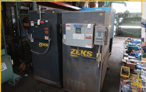
(2) ZEKS 1600HSFA400