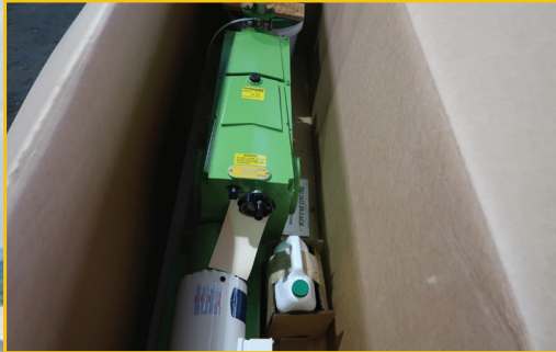
PULSAR FEEDER 7600-S-E