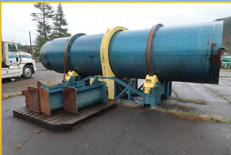
2012 DIDION RS200 ROTARY SHAKE OUT DRUM

Location: 29017 NE Healy Rd., Amboy, WA 98601