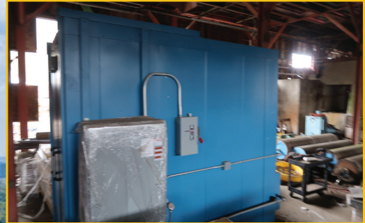
WISCONSIN OVEN CORP. EWN-48-8E3.5