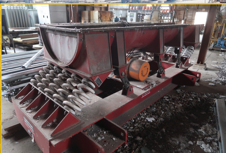
CONVEYOR DYNAMICS VIBRATORY FEEDER