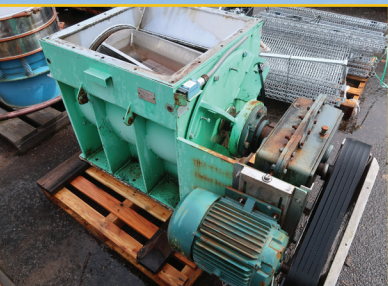
MASTER MACHINE RBLD