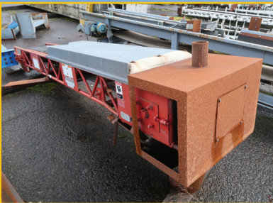
24\"X21\" BELT TRANSFER