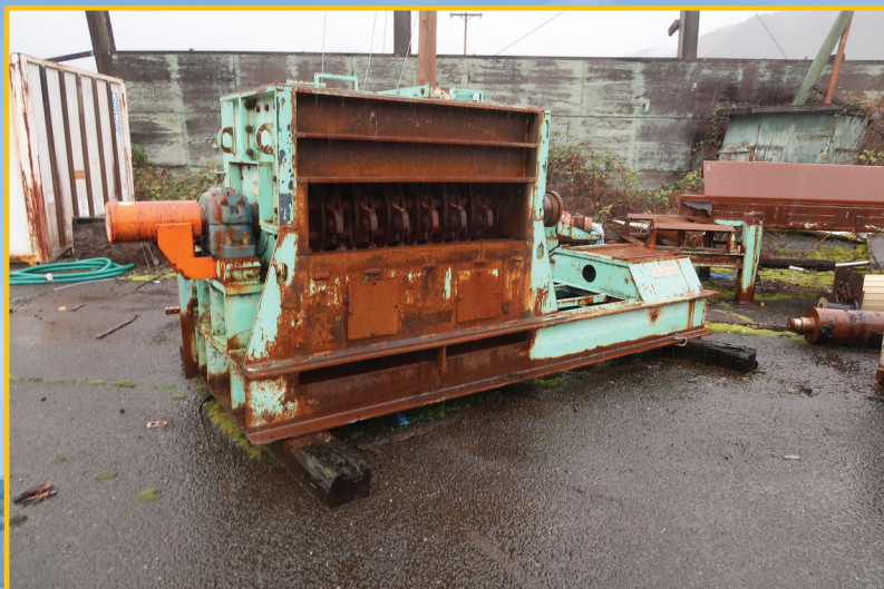
WSM 3456BH WOOD GRINDER