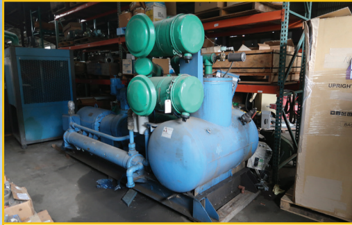
1984 QNW 1500A