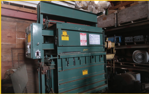
1999 CONSOLIDATED STD6