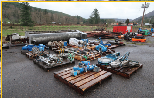
LARGE ASSORTMENT OF VALVES