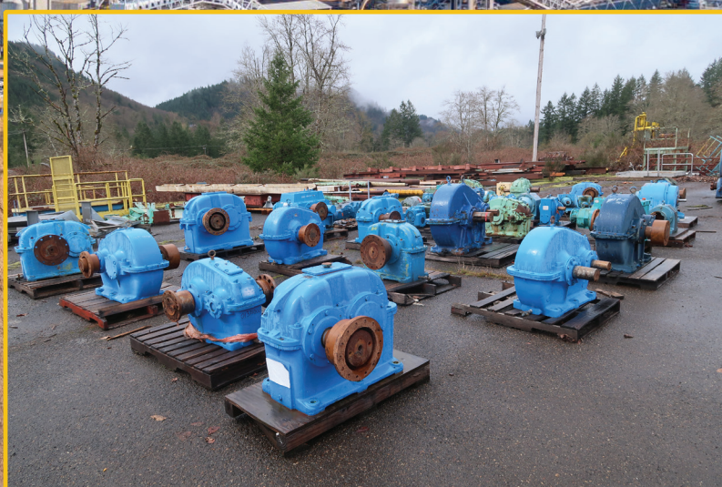
LARGE ASSORTMENT OF REDUCERS & MOTORS