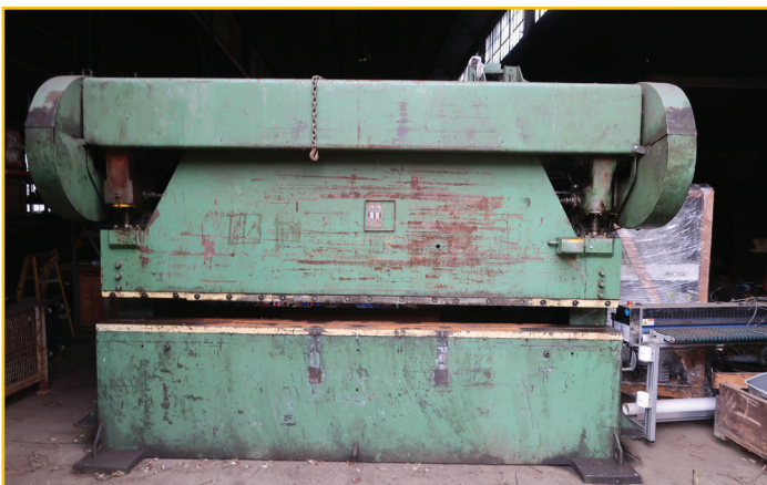
CYRIL BATH 150-10 MECHANICAL PRESS BRAKE