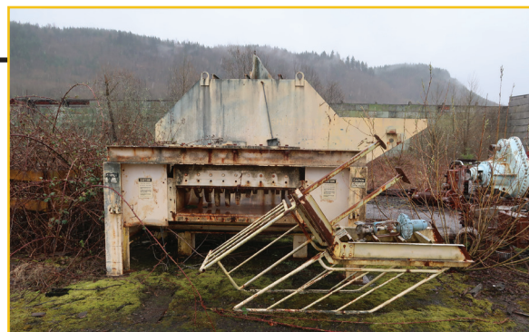
SHED PAX SYSTEMS INC. 58\"X48\" SHREDDER