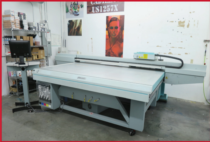
2011 FUJI ACUITY ADVANCE HS-WIO