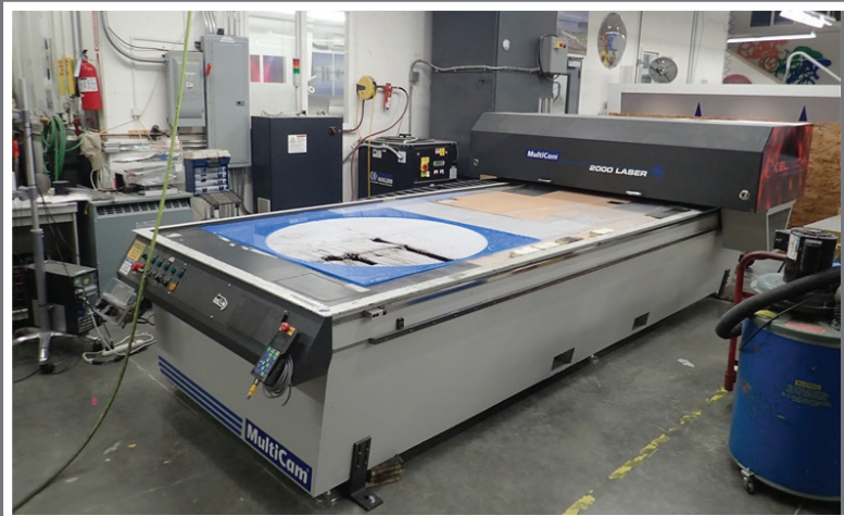
2013 MULTICAM SERIES 2000