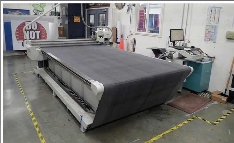
2011 ESKO KONGSBERG MULTICUT IXL24