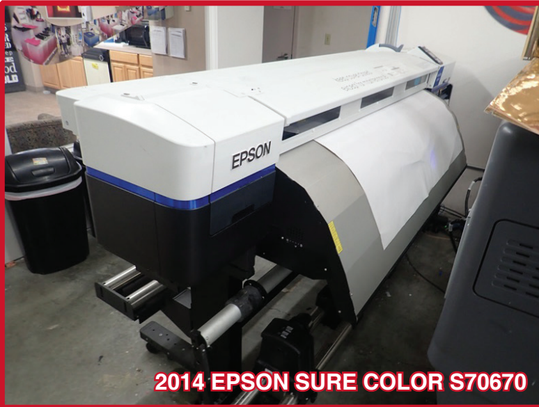
2014 EPSON SURE COLOR S70670