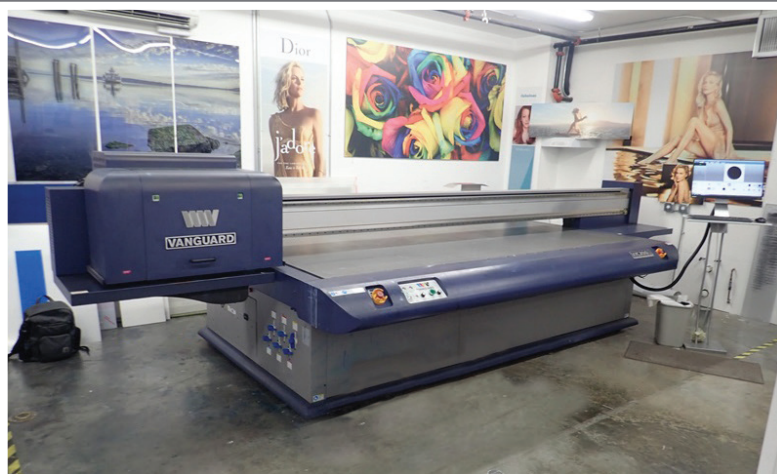
2017 VANGUARD VK300D

ONLINE BIDDING AVAILABLE AT MURPHYAUCTION.COM