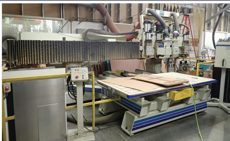
1995 KOMO VR804TT