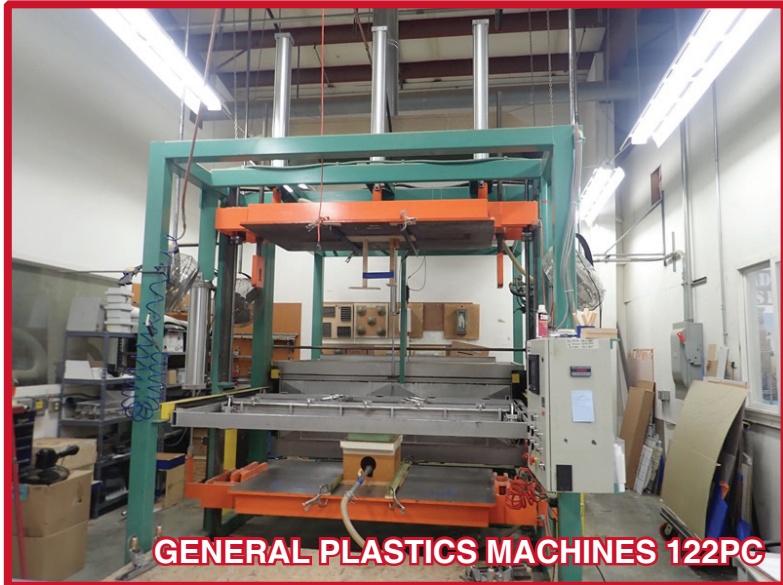
GENERAL PLASTICS MACHINES 122PC