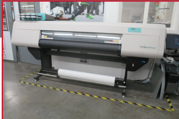
2015 FUJI ACUITY LED 1600