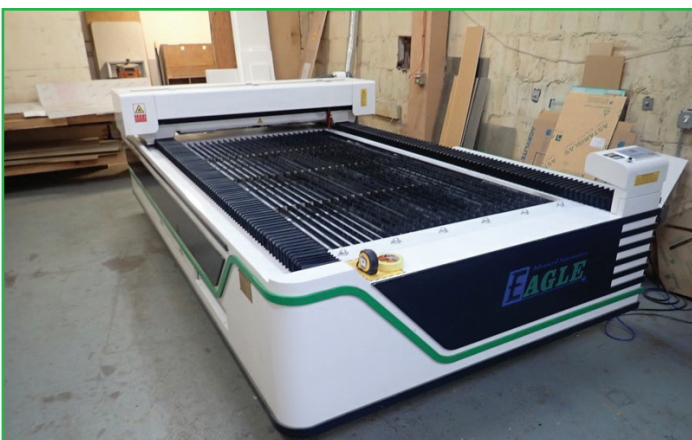
2022 EAGLE H1325 300 WATT CNC CO2 LASER CUTTER