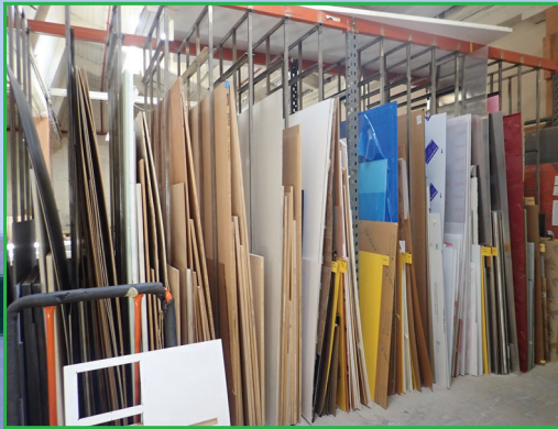
SHEET GOODS RACK & INVENTORY