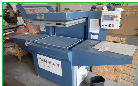
2017 STARVIEW SP-2436 24"X36" SKIN PACKAGING MACHINE

Location: 37 South Hudson Street, Seattle, WA 98134