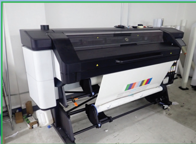
2021 HP LATEX 700W