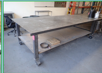
(4) STEEL FAB TABLES