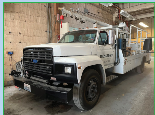
1990 FORD F600