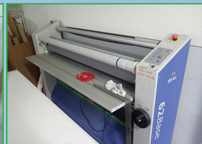
SEAL 62 BASE

FOR MORE INFORMATION GO TO MURPHYAUCTION.COM • PHONE 425.486.1246