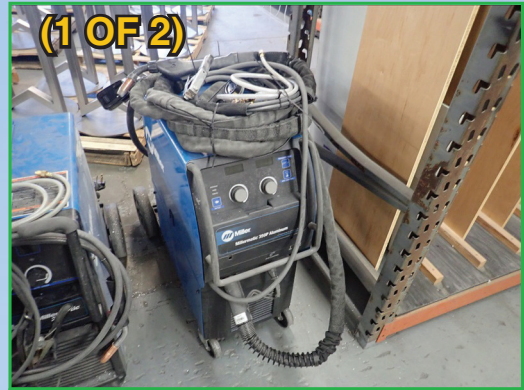
(1 OF 2) MILLER MILLERMATIC 350P