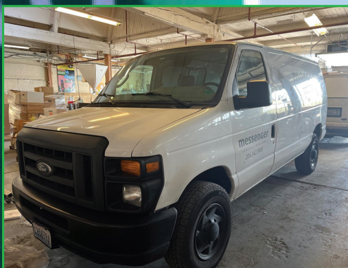
2013 FORD E250