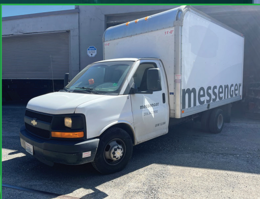
2012 CHEVROLET EXPRESS