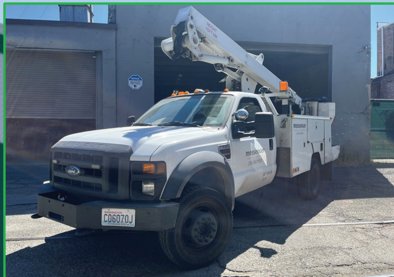
2008 FORD F550