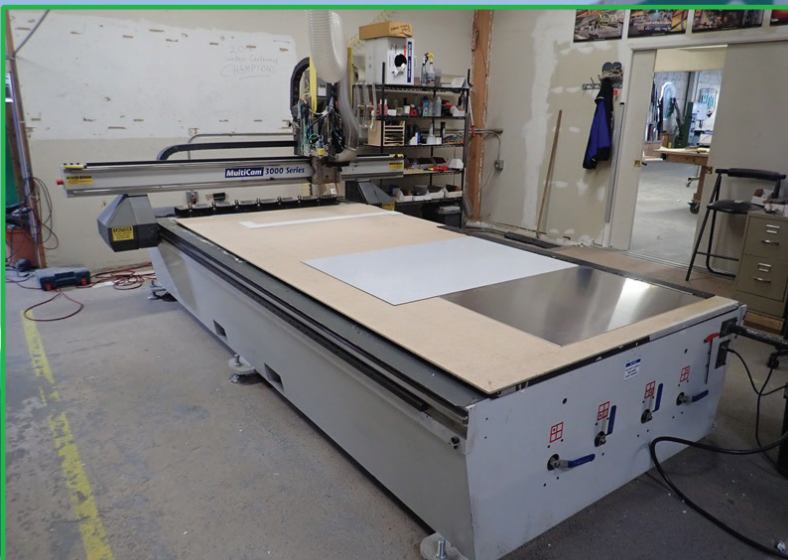
2015 MULTICAM 3000 SERIES 3-204-R-PF CNC ROUTER

Location: 37 South Hudson Street, Seattle, WA 98134