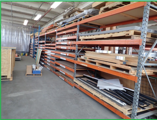
(16) SECTIONS OF PALLET RACKING