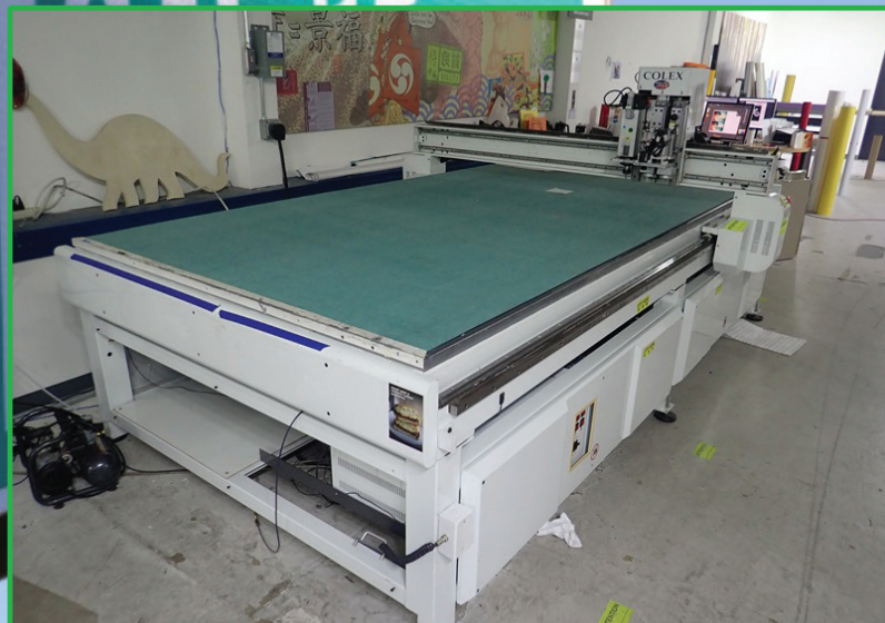
2016 COLEX FBC5X10 FLATBED CUTTER/ROUTER