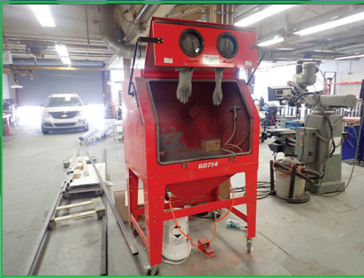
2016 GRIZZLY G0714