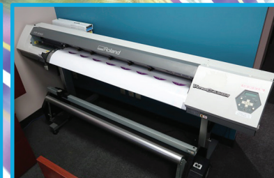
ROLAND VERSACAMM VP-540