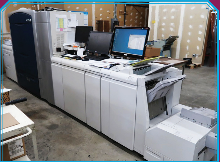
XEROX COLOR 1000