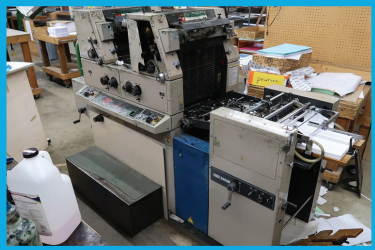
RYOBI LIMITED 3302M