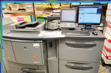
KONICA MINOLTA C6500