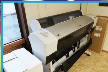
2007 EPSON STYLIS PRO 9800