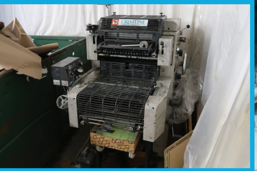
RYOBI LIMITED 3200MCD