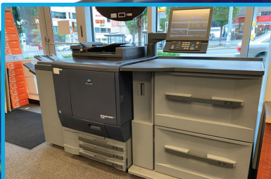
KONICA MINOLTA C7000