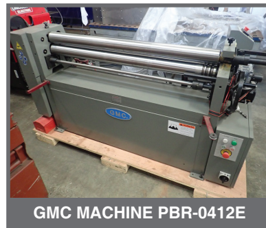
GMC MACHINE PBR-0412E