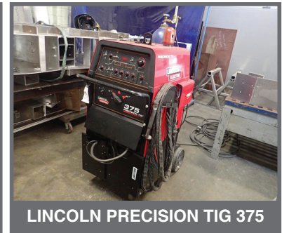
LINCOLN PRECISION TIG 375