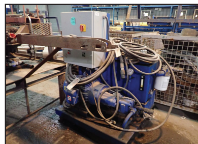
20 HP PORTABLE HYDRAULIC UNIT