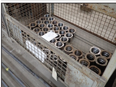
(100+) STEEL CAGES W/ASSORTED HRTB HARDWARE