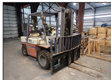
1997 NISSAN WGF03H40V