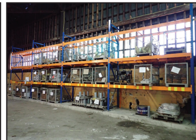
(10) SECTIONS OF ADJUSTABLE PALLET RACKING