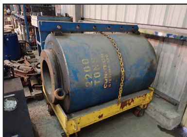
2,200-TON CAP HYDRAULIC RAM