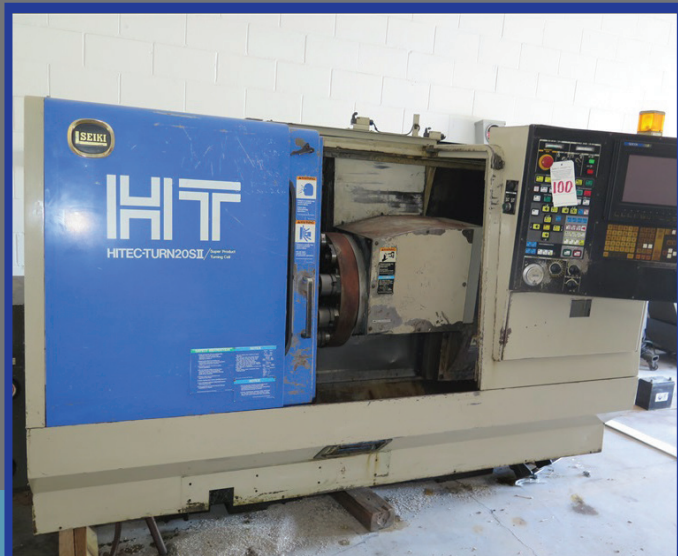
HITACHI SEIKI HT20SII