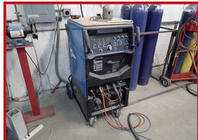
MILLER SYNCROWAVE 350LX

MURPHYAUCTION.COM FOR ADDITIONAL INFORMATION