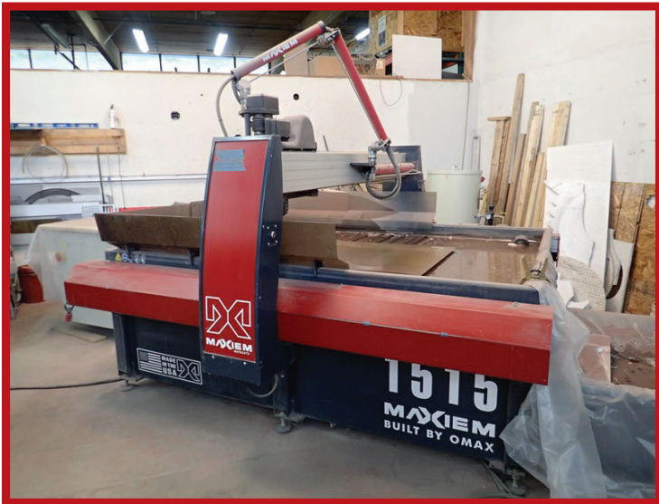
2016 OMAX MAXIEM 1515

11828 NE 112TH STREET, KIRKLAND, WA 98033