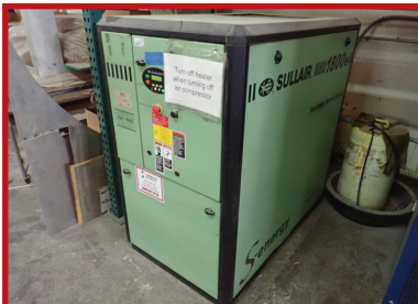
2007 SULLAIR 1809EV/A