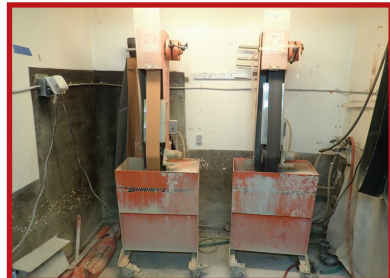
(2) SOMACA BM-1066-RP24