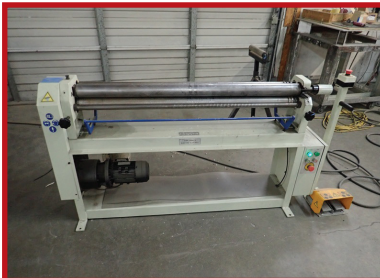
2014 BIRMINGHAM ESR-1300X1.5