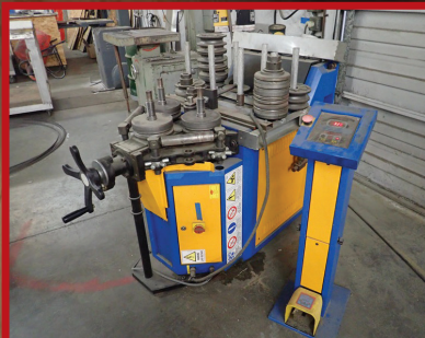
2005 CML CE40MR3