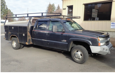
2003 CHEVROLET 3500