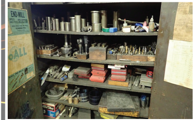
ASSORTMENT OF INSPECTION TOOLING, ENDMILLS & BITS