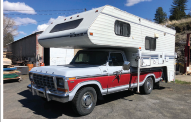
FORD F250 RANGER