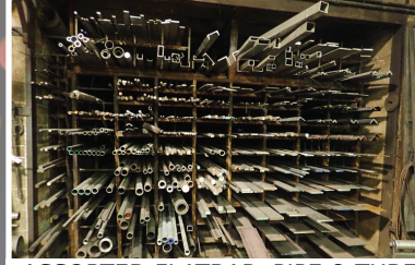
ASSORTED FLATBAR, PIPE & TUBE INVENTORY