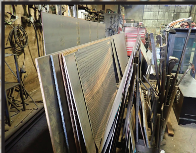
ASSORTED STEEL INVENTORY