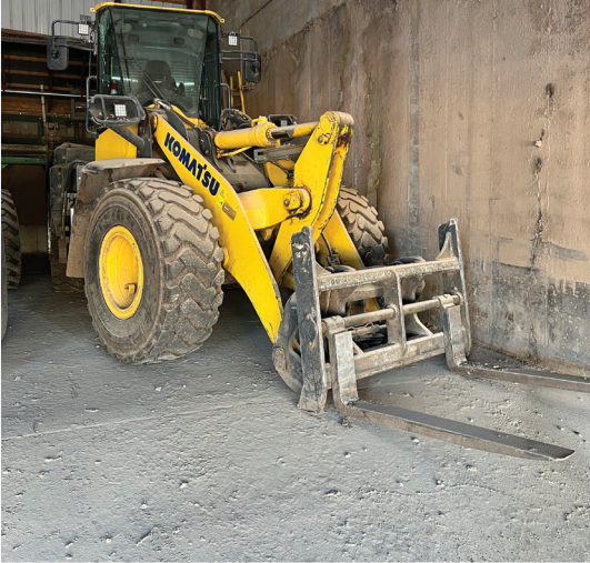
2020 KOMATSU WA270-8