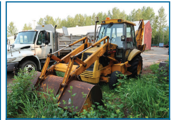
JCB 217 SERIES 2