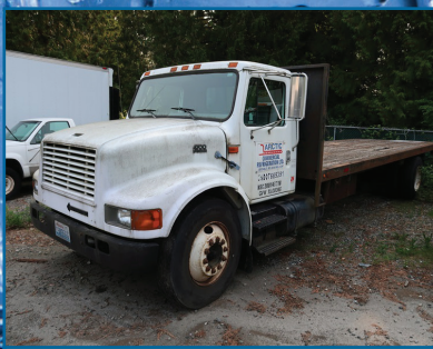
1999 INTERNATIONAL 4700 4X2