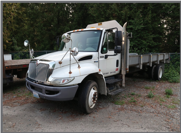
2007 INTERNATIONAL 4300 SBA 4X2