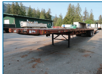
1996 FONTAINE FTW-5-8053SLAW