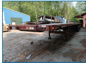
1995 FONTAINE FTW-5-8048WSAW