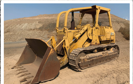
1979 CAT 977L