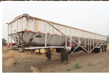
2005 TRINITY 36" BELT TRI/A