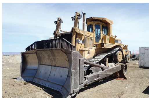
1990 CAT D10N