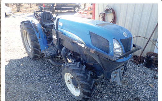
2011 NEW HOLLAND T4050V