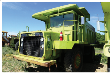
1979 TEREX 33-05B