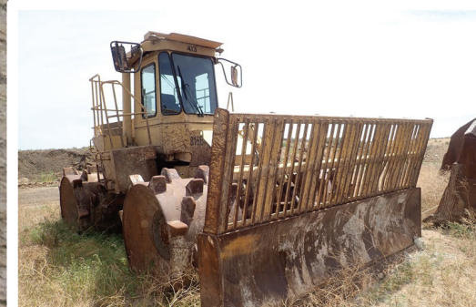
1990 CAT 816B