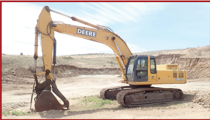
2002 JOHN DEERE 330C LC