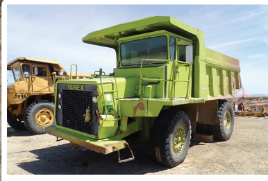
1980 TEREX 33-05B