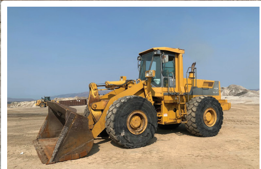
1995 KOMATSU WA450-2