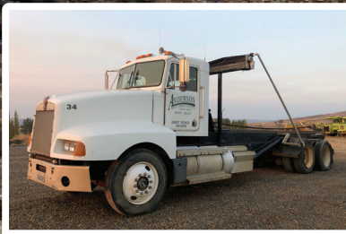
1989 KENWORTH T600A