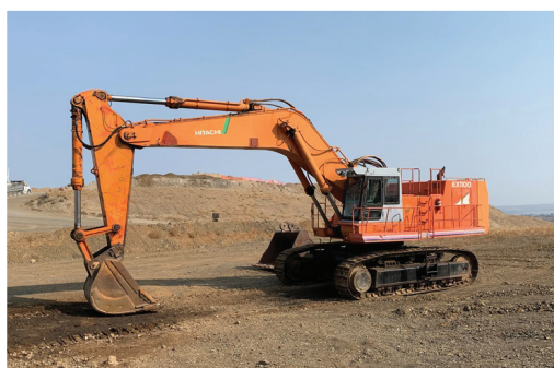
1992 HITACHI EX1100