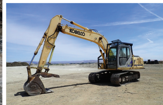
2004 KOBELCO SK160LC