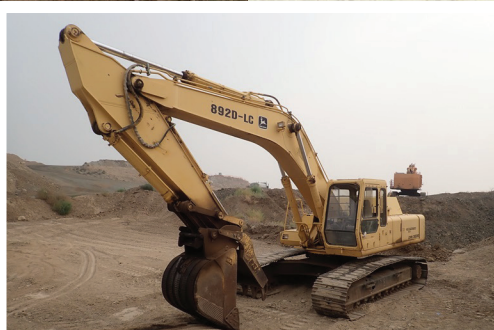
1988 JOHN DEERE 892D LC