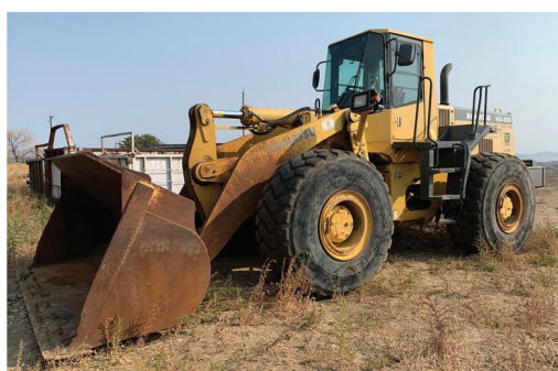
1999 KOMATSU WA450-3MC