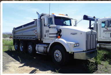
1997 KENWORTH T800B