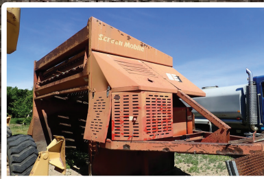
1999 EXTEC SCREEN MOBILE