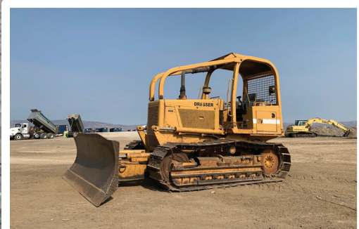
1996 DRESSER TD9H