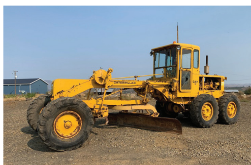
1965 CAT 12E