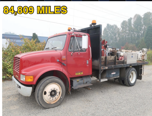
1993 INTERNATIONAL 4600