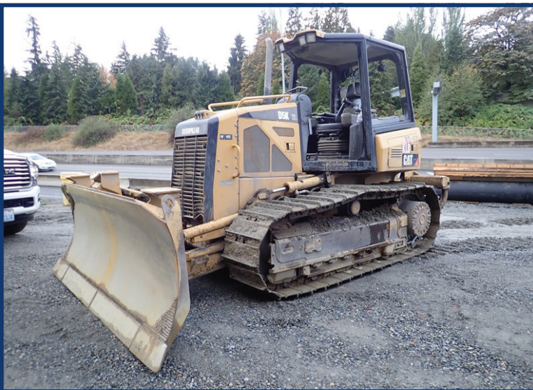
2010 CAT D5K XL

START DATE: 11:00 AM | THURSDAY - DECEMBER 1 END DATE: 11:00 AM | THURSDAY - DECEMBER 8