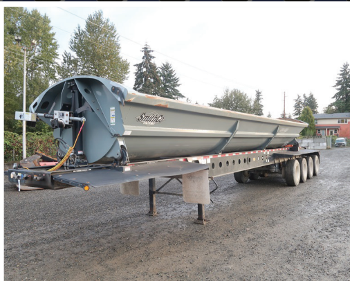
2018 SMITHCO SX4-49-36