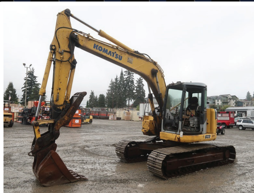
2003 KOMATSU PC138USLC-2