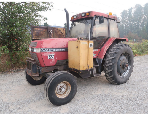
2000 CASE 5140