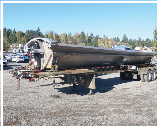
2021 CROSS COUNTRY