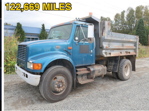
1995 INTERNATIONAL 4700