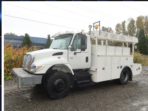
2003 INTERNATIONAL 7400