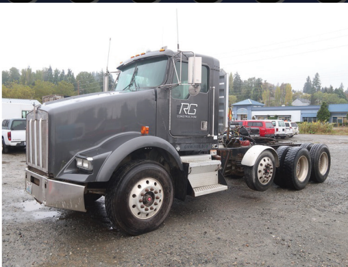
2000 KENWORTH T800