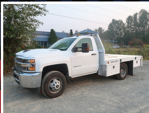
2019 CHEV 3500HD