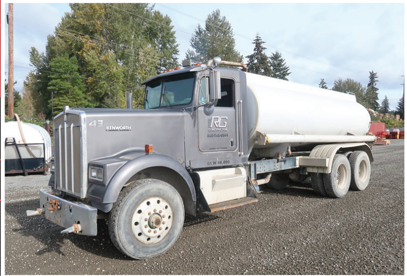
1983 KENWORTH W900