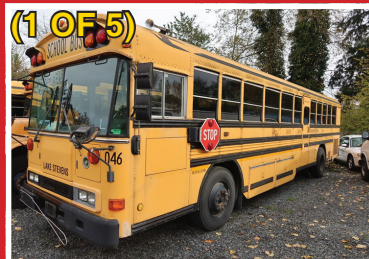
2001 BLUEBIRD A3RE