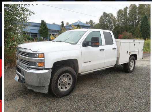
2016 CHEV 3500HD

1.800.426.3008 - 425.486.1246 - murphyauction.com