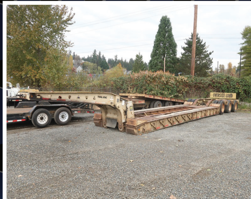
2004 TRAIL KING TKT110HDG