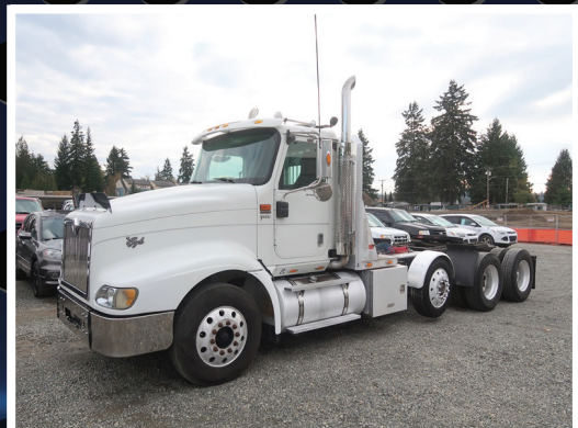
2006 INTERNATIONAL EAGLE 9400