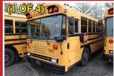
1999 BLUEBIRD TCRE