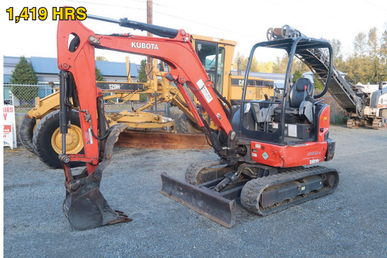
2017 KUBOTA KX033-4

1.800.426.3008 - 425.486.1246 - murphyauction.com