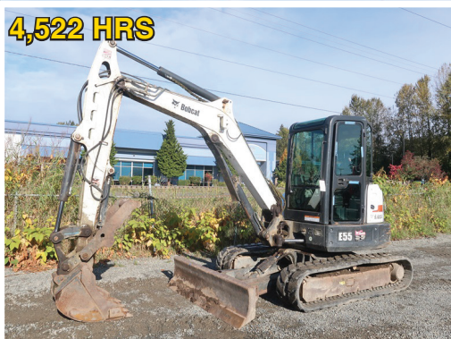
2012 BOBCAT E55M