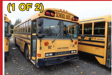
2000 BLUEBIRD A3RE