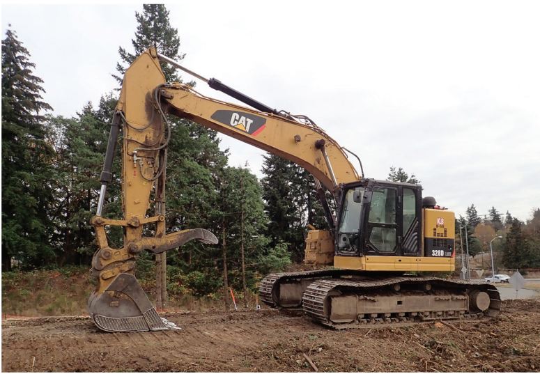
2014 CAT 328D LCR