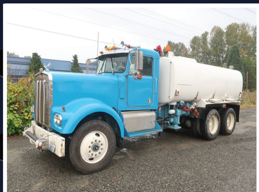
1976 KENWORTH W900A