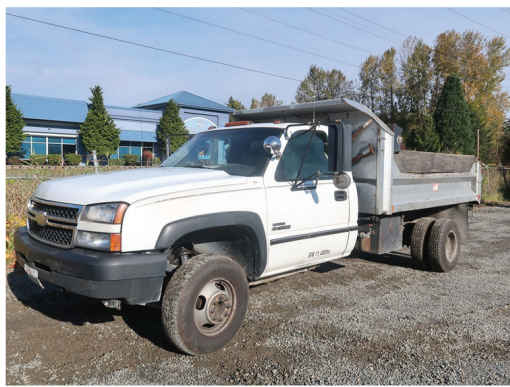
2006 CHEV 3500