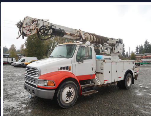
2006 STERLING ACTERRA