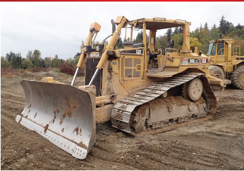
2006 CAT D6R XW III