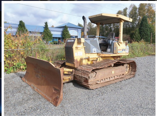
2005 KOMATSU D41P-6C