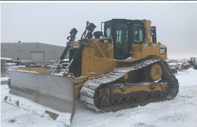
2011 CAT D6T LGP