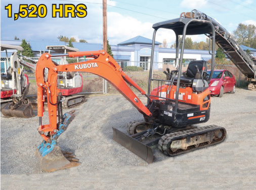
2019 KUBOTA U17