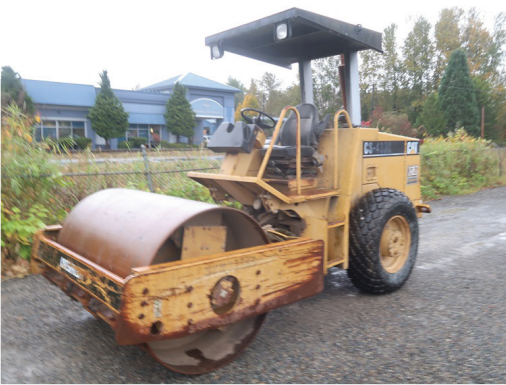
1998 CAT CS433C