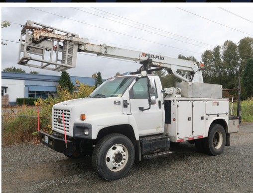
2004 CHEV C7500