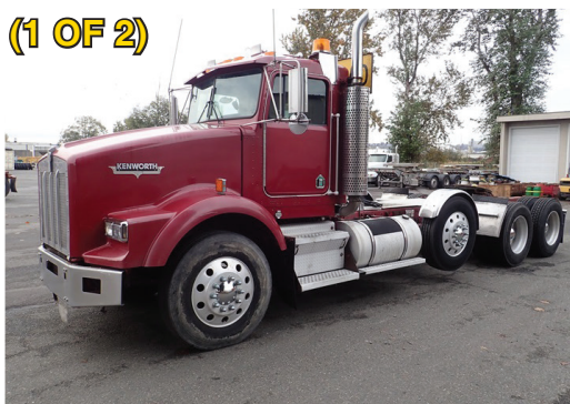
1998 KENWORTH T800