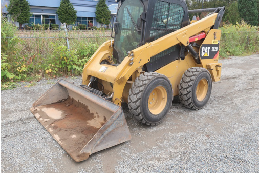
2017 CAT 262D