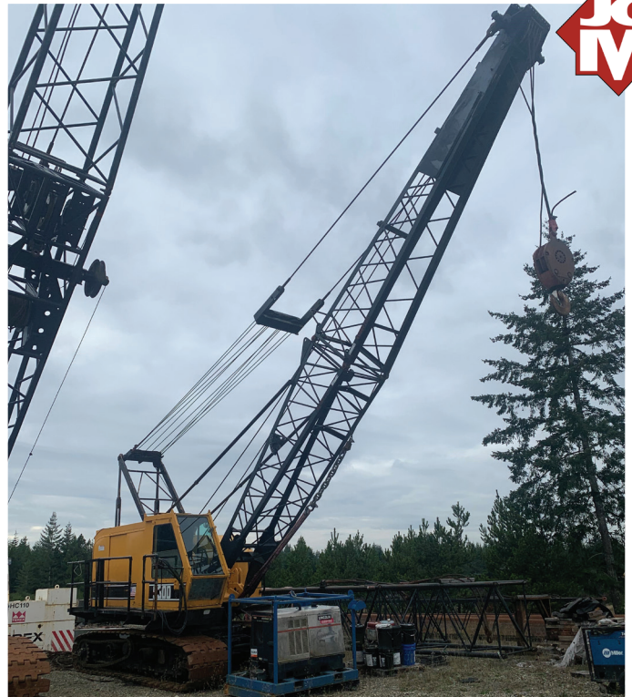
1988 AMERICAN 5300 70-TON CRAWLER CRANE

THESE ITEMS TO SOLD IN ABSENTIA LOCATED IN LAKE STEVENS, WA. GO TO MURPHYAUCTION.COM FOR MORE INFO