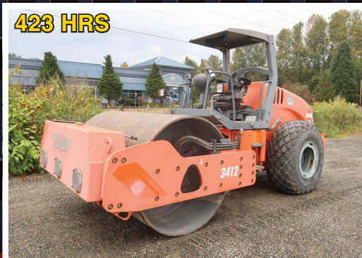
2004 HAMM 3412