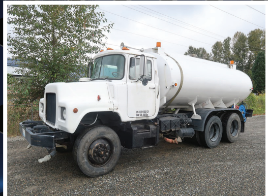
1978 MACK DM686