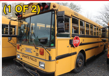
1997 THOMAS MVP-ER