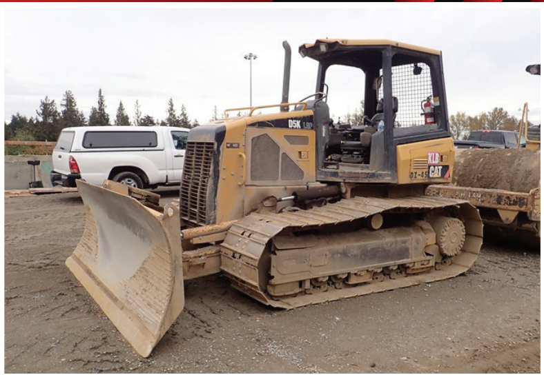
2008 CAT D5K LGP