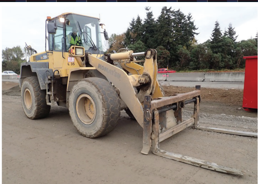
2011 KOMATSU WA320-6

8 DOZERS, 23 EXCAVATORS, 3 GRADERS, 6 LOADERS, 3 BACKHOES, 5 ROLLERS, 10 TRACTORS, 8 DUMP TRUCKS, 6 SWEEPERS, 4 SERVICE BODY TRUCKS, 3 WATER TRUCKS, 3 BUCKET TRUCKS, 13 FLATBED TRUCKS AND MUCH MORE! MURPHYAUCTION.COM IS UPDATED DAILY!