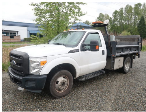
2011 FORD F350