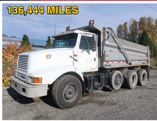
2002 INTERNATIONAL 2674