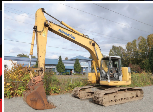
2006 KOMATSU PC228USLC-3NO