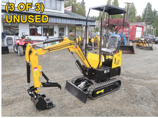
2022 AGROTK L12