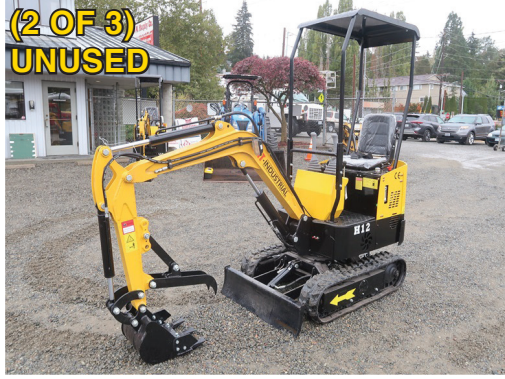
2022 AGROTK L12