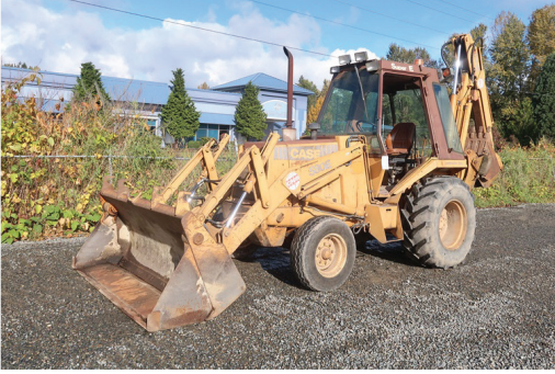
1986 CASE 580 SUPER E