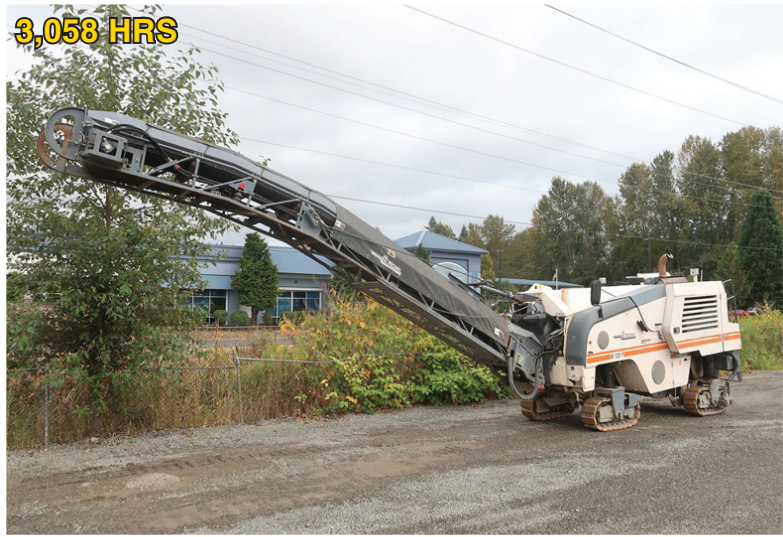
2006 WIRTGEN W120F