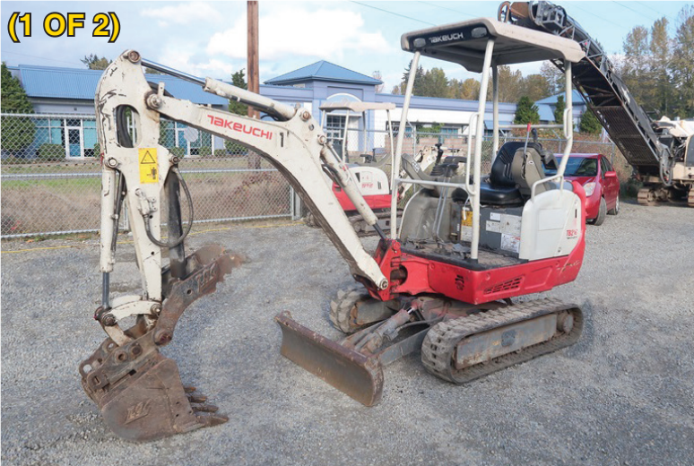
2017 & 2016 TAKEUCHI TB216