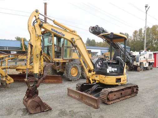
2006 KOMATSU PC35MR-2