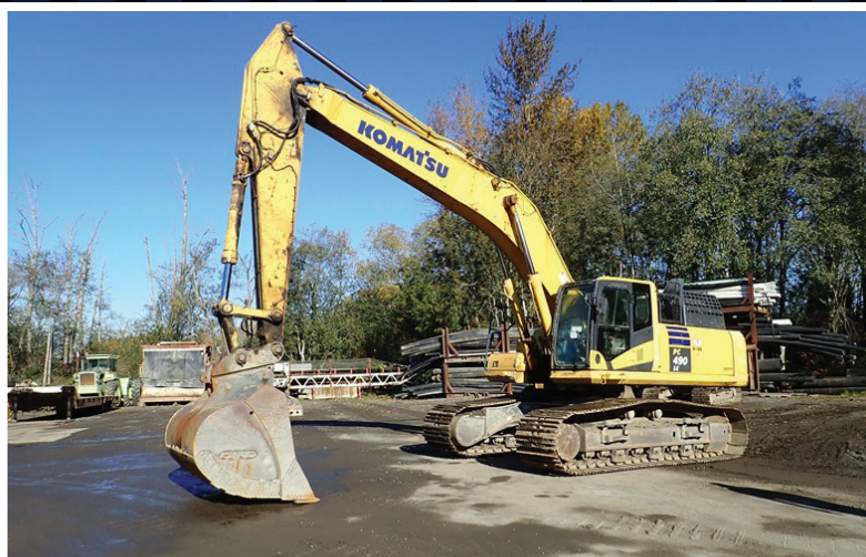
2016 KOMATSU PC490LC-11

8 DOZERS, 23 EXCAVATORS, 3 GRADERS, 6 LOADERS, 3 BACKHOES, 5 ROLLERS, 10 TRACTORS, 8 DUMP TRUCKS, 6 SWEEPERS, 4 SERVICE BODY TRUCKS, 3 WATER TRUCKS, 3 BUCKET TRUCKS, 13 FLATBED TRUCKS AND MUCH MORE! MURPHYAUCTION.COM IS UPDATED DAILY!