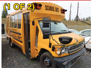
2001 FORD GIRARDIN E450

THESE ITEMS TO SOLD IN ABSENTIA LOCATED IN LAKE STEVENS, WA. GO TO MURPHYAUCTION.COM FOR MORE INFO