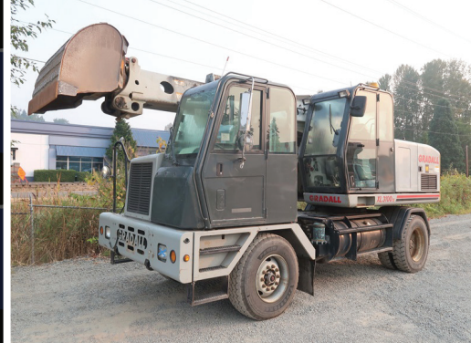
2008 GRADALL XL3100 SERIES 3