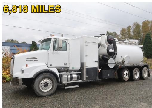
2015 WESTERN STAR W4800SB