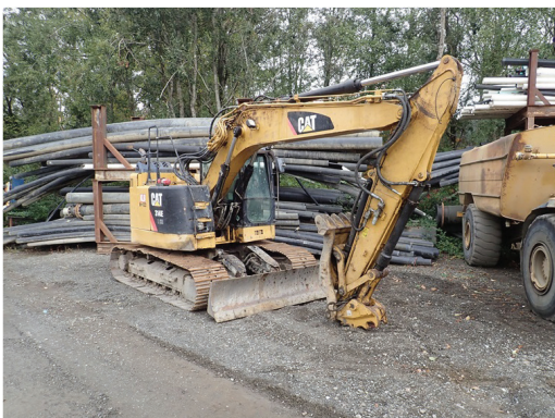
2013 CAT 314E LCR