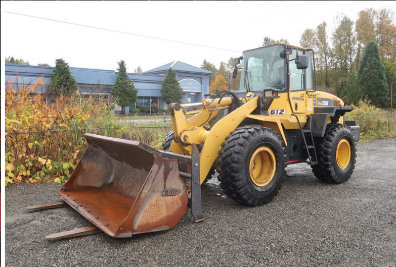
2006 KOMATSU WA250-5L

1.800.426.3008 - 425.486.1246 - murphyauction.com