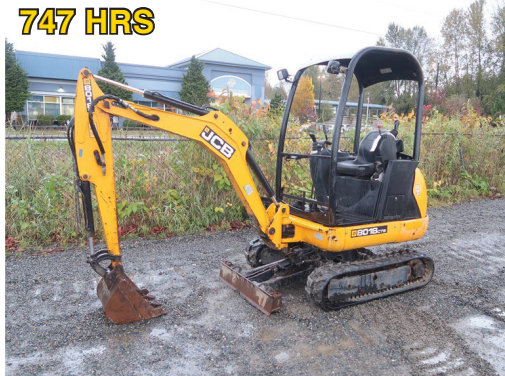
2014 JCB 8018CTS