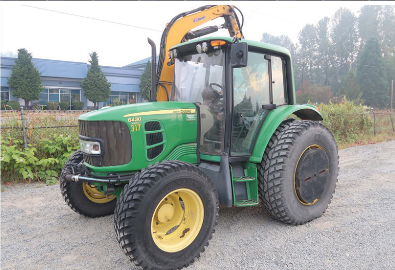
2012 JOHN DEERE 6430