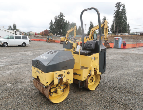
2004 BOMAG BW900AD