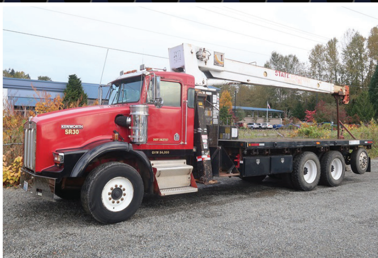
1996 KENWORTH T800