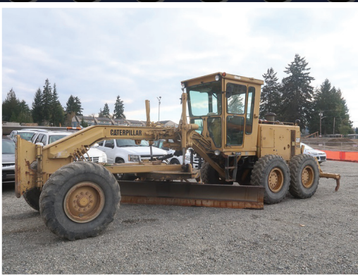
1994 CAT 140G VHP