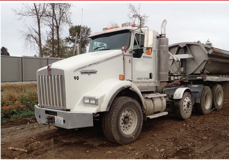
2011 KENWORTH T800B