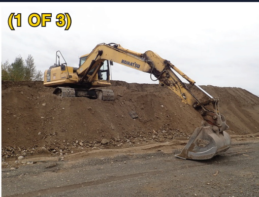
2009 KOMATSU PC160LC-7EO