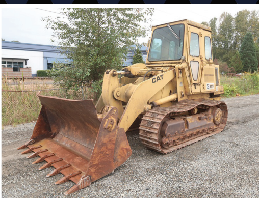
1989 CAT 953