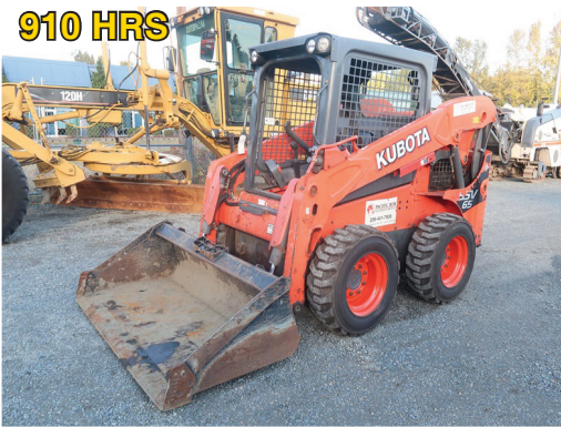
2016 KUBOTA SSV65