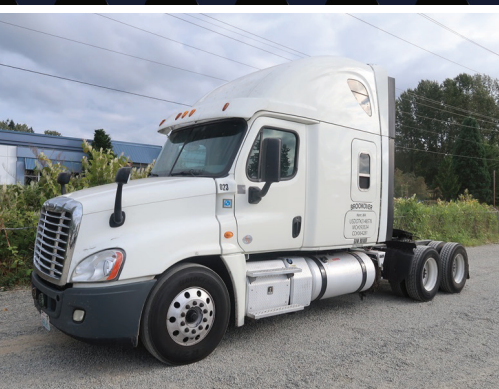
2014 FREIGHTLINER PX125