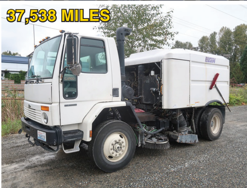
2003 STERLING SC8000