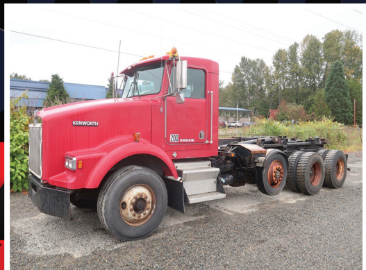
1993 KENWORTH T800B

1.800.426.3008 - 425.486.1246 - murphyauction.com