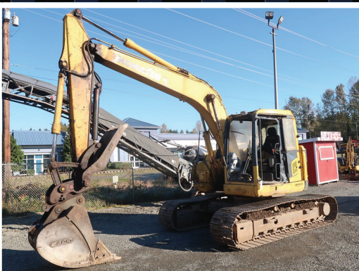
2008 KOMATSU PC138USLC-8