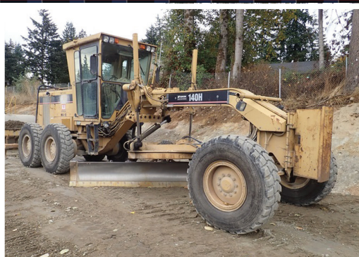
1996 CAT 140H VHP