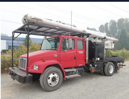
1998 FREIGHTLINER FL70