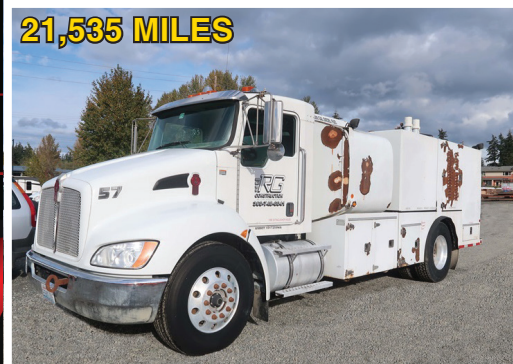
2008 KENWORTH T370