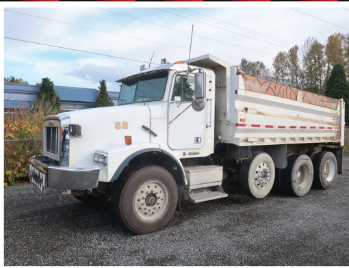
1997 FREIGHTLINER FLD112