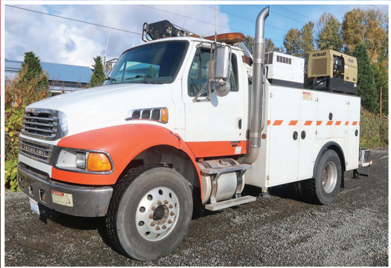
2006 STERLING ACTERRA