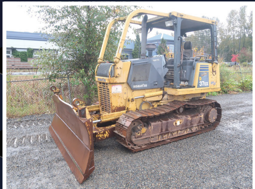
2004 KOMATSU D37EX-21