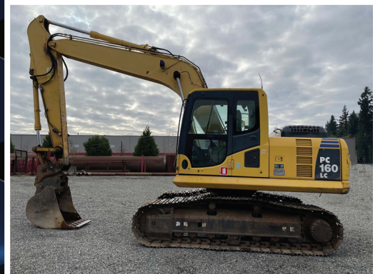
2013 KOMATSU PC160LC-8