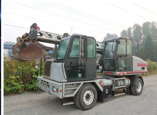
2003 GRADALL XL3100