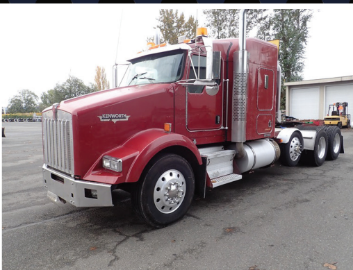
2006 KENWORTH T800