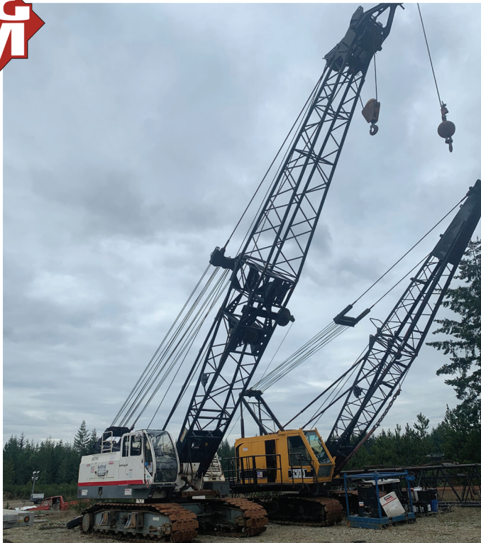
2001 AMERICAN TEREX HC110 110-TON CRAWLER CRANE