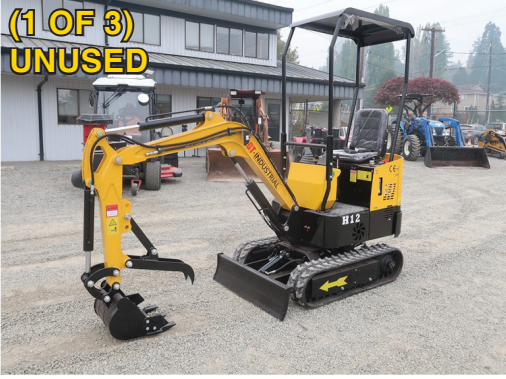
2022 AGROTK L12