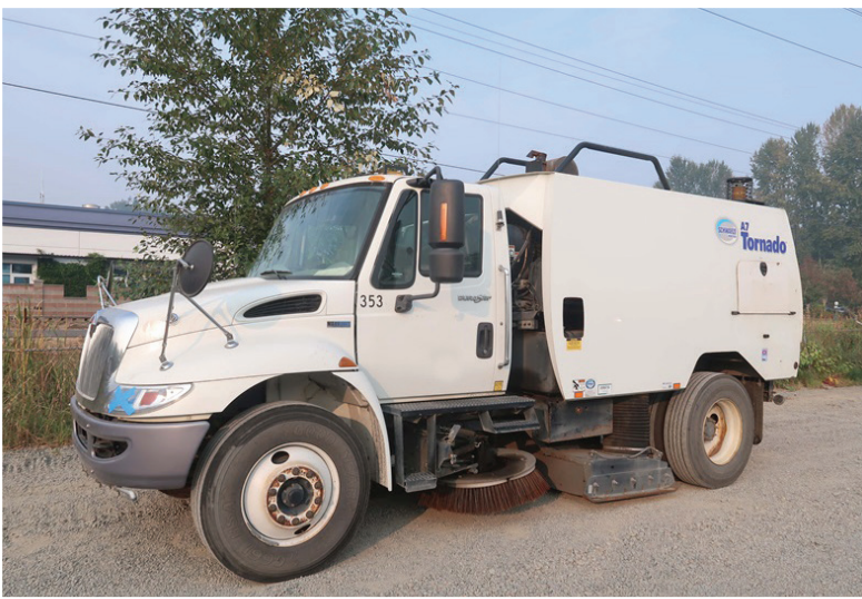
2014 INTERNATIONAL 4300