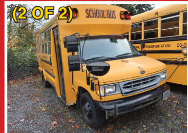
2001 FORD GIRARDIN E450