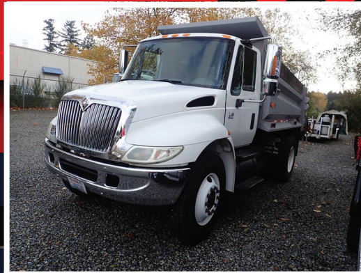
2005 INTERNATIONAL 4400