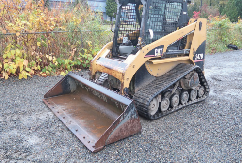
2004 CAT 247B