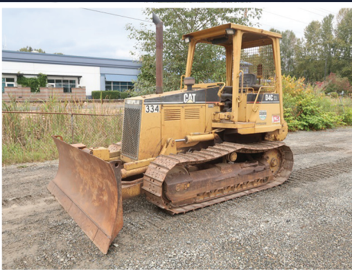
1995 CAT D4C SERIES 3 XL