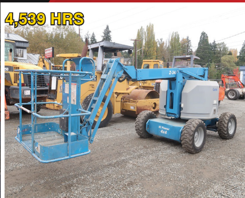
2003 GENIE Z34