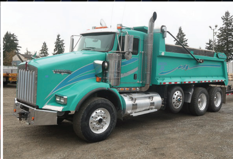
2008 KENWORTH T800