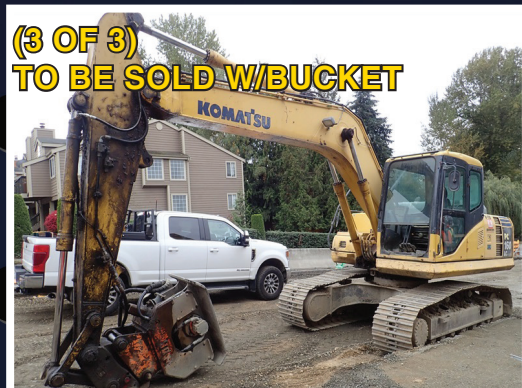
2009 KOMATSU PC160LC-7EO