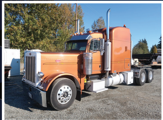
2003 PETERBILT 379