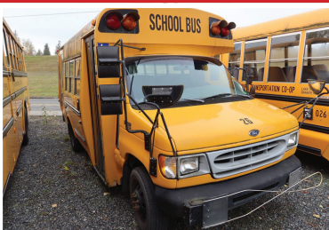
1998 FORD GIRARDIN E350