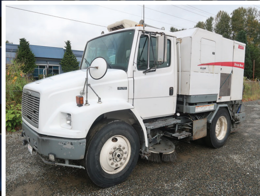
2002 FREIGHTLINER FL70