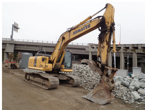
2014 KOMATSU PC210LC-10