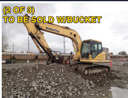
2009 KOMATSU PC160LC-7EO