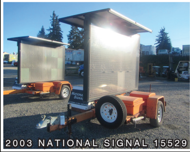
2003 NATIONAL SIGNAL 15529