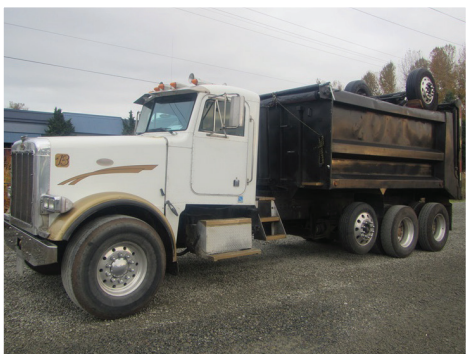
2000 PETERBILT 357