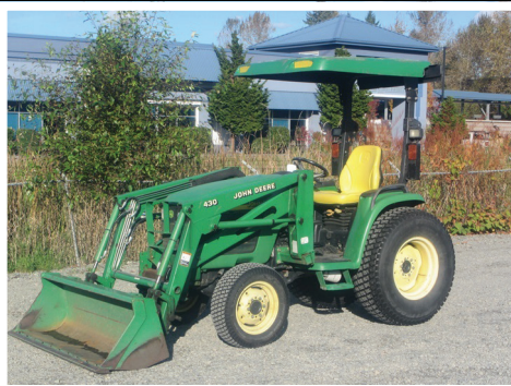
2004 JOHN DEERE 4410