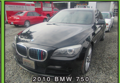
2010 BMW 750