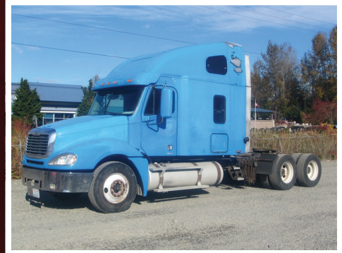
2006 FREIGHTLINER COLUMBIA