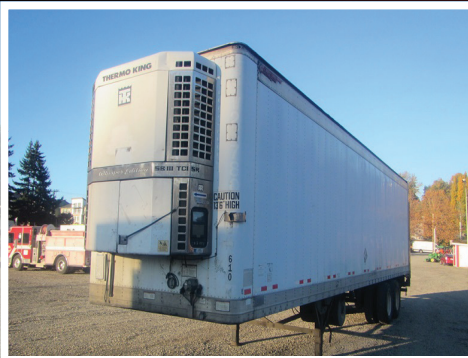
2002 GREAT DANE