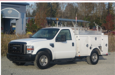
2008 FORD F250