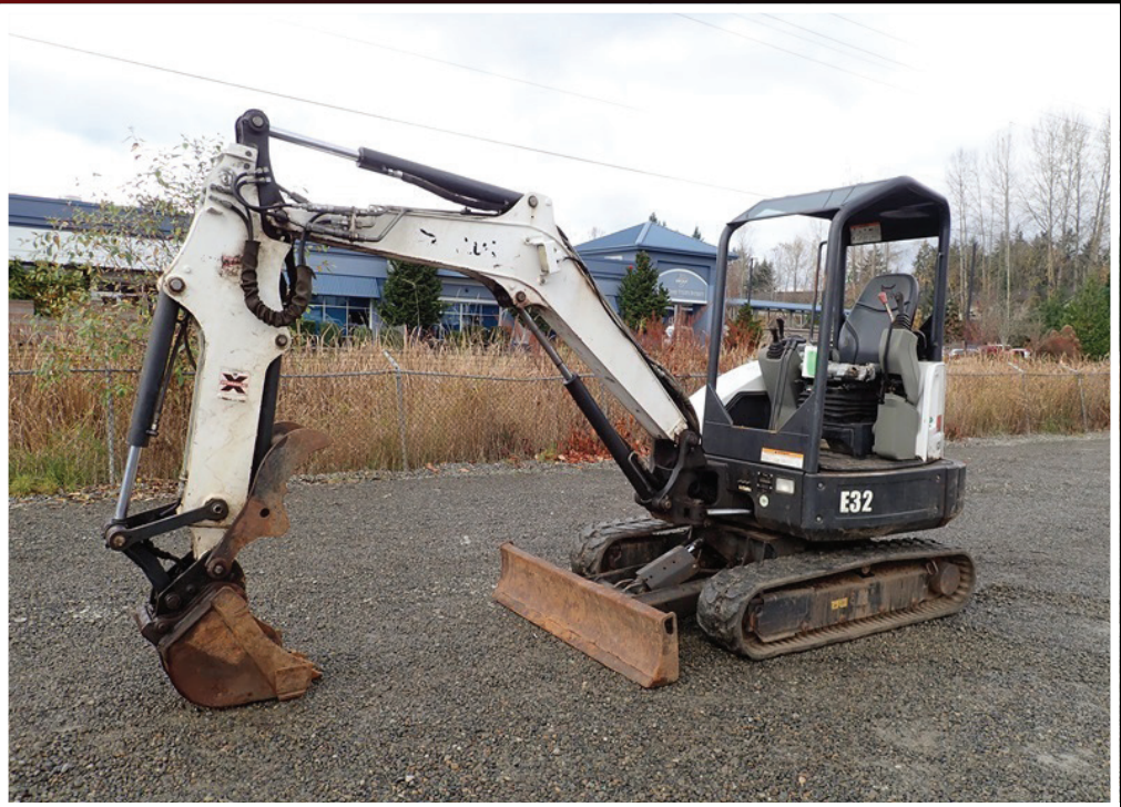
2013 BOBCAT E32 M