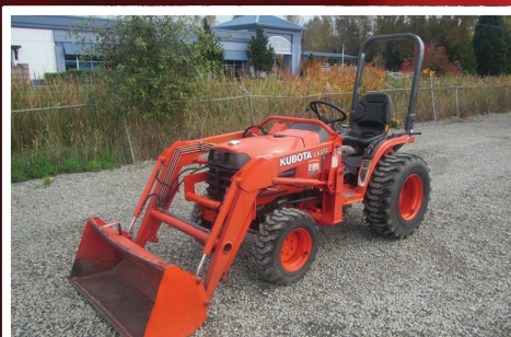
2001 KUBOTA B7500D