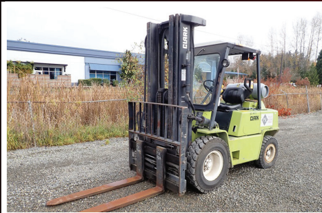
1992 CLARK C500-YS80