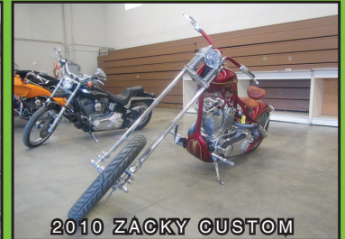
2010 ZACKY CUSTOM