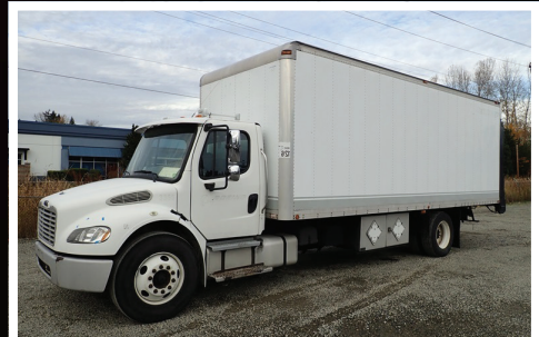
2006 FREIGHTLINER M2

1.800.426.3008 - 425.486.1246 - murphyauction.com