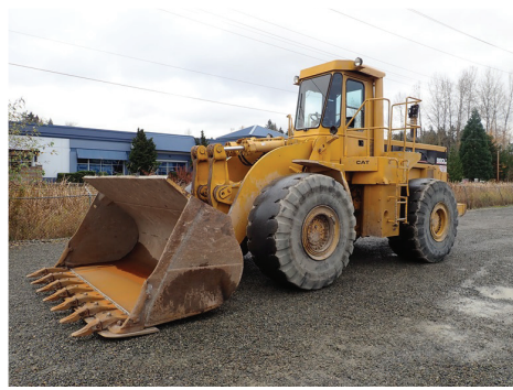
1980 CAT 980C