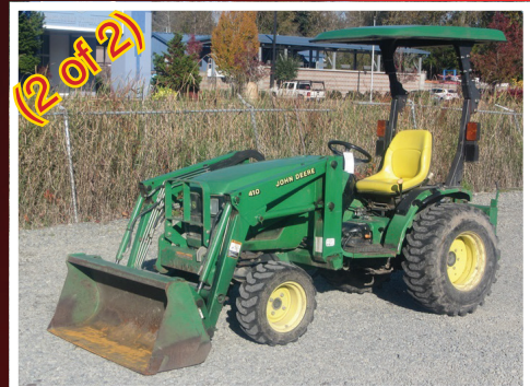
2004 JOHN DEERE 4115