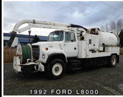
1992 FORD L8000