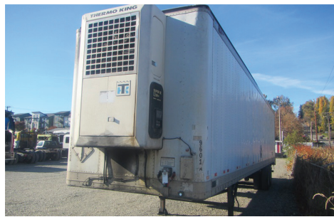
1999 GREAT DANE 7011TZ-145