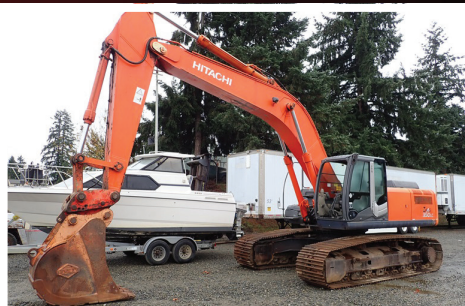
2006 HITACHI ZX330LC-3