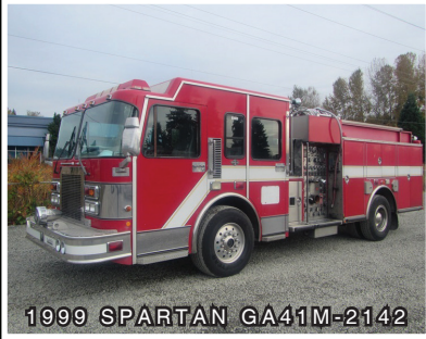
1999 SPARTAN GA41M-2142