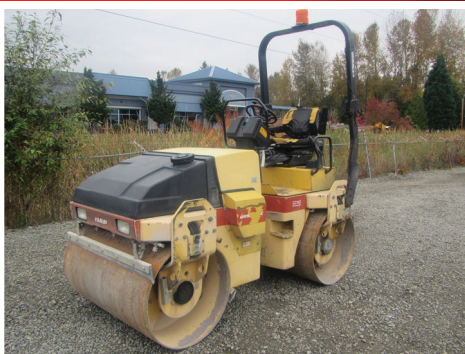
2003 DYNAPAC CC142