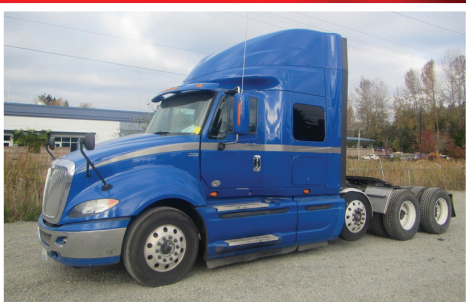
2014 INT'L PRO STAR +