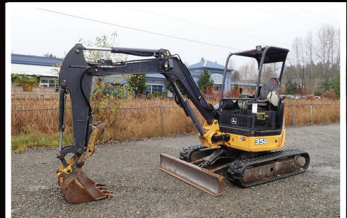
2012 JOHN DEERE 35D

1.800.426.3008 - 425.486.1246 - murphyauction.com