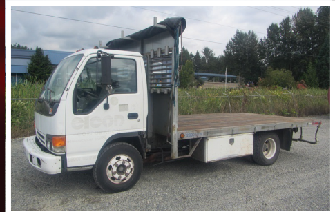
1997 ISUZU NPR