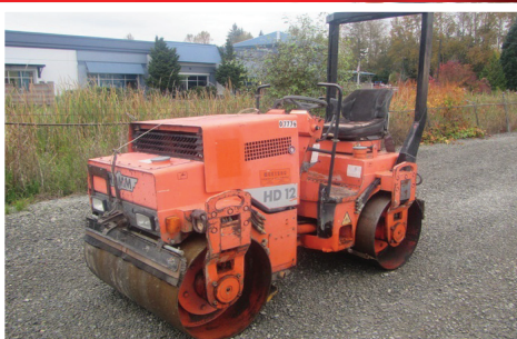
1997 HAMM HD12