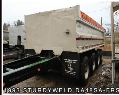
1993 STURDYWELD DA48SA-FRS