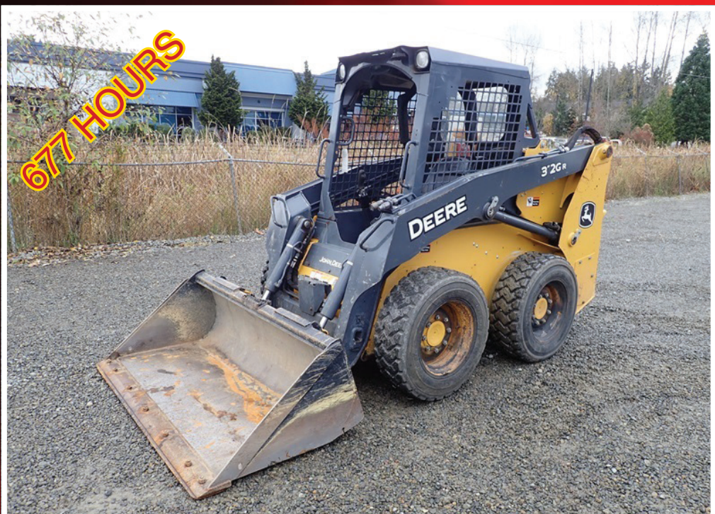
2017 JOHN DEERE 312GR