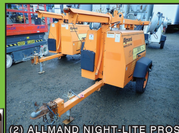
(2) ALLMAND NIGHT-LITE PROS