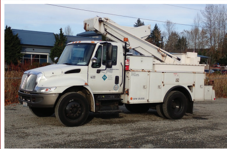
2005 INT'L 4300