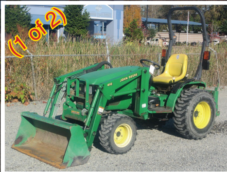
2004 JOHN DEERE 4115