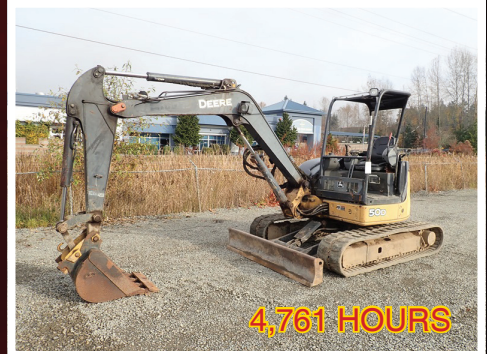
2007 JOHN DEERE 50D