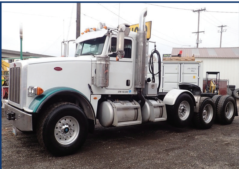
2009 PETERBILT 367