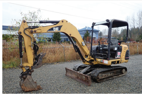
2005 CAT 302.5