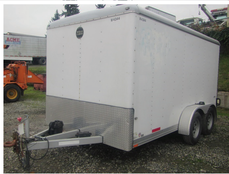
2008 WELLS CARGO CW1422-102