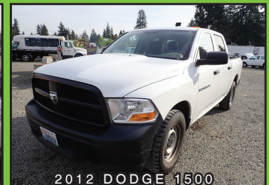
2012 DODGE 1500