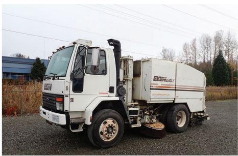
1997 FORD CARGO