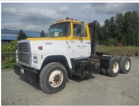
1989 FORD L9000