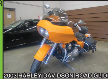
2003 HARLEY DAVIDSON ROAD GLIDE