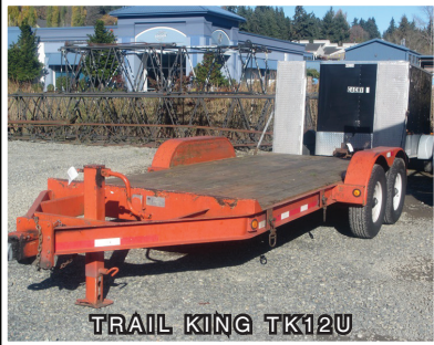
TRAIL KING TK12U