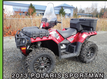
2013 POLARIS SPORTSMAN