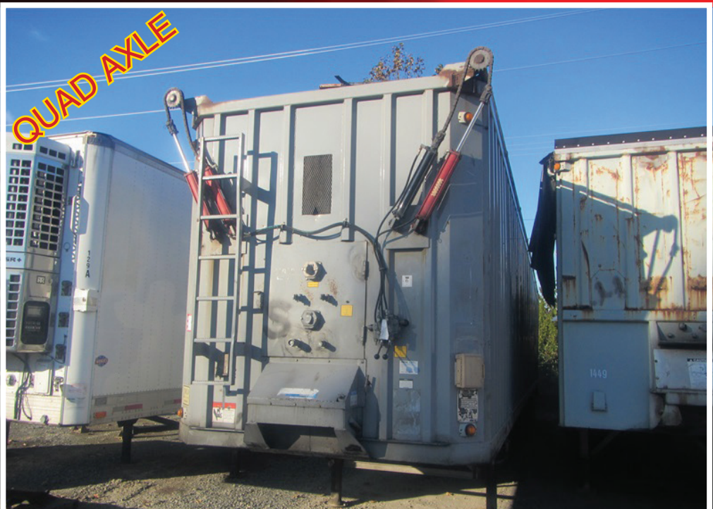
2007 IMCO 53S102W