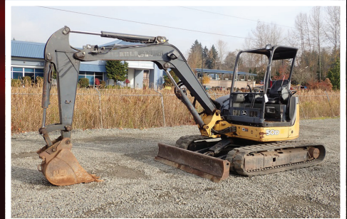
2006 JOHN DEERE 50D