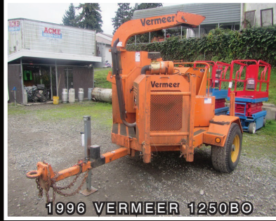
1996 VERMEER 1250BO