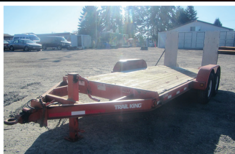
2003 TRAIL KING TK12U