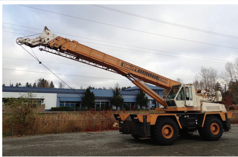
1979 CASE/DROTT 5550C