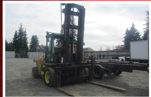
1996 HYSTER H190XL