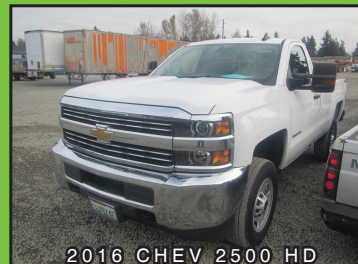
2016 CHEV 2500 HD