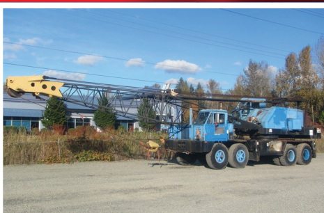
1973 P&H 440TC