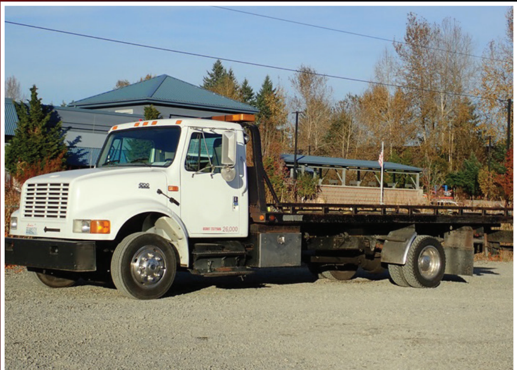
2000 INT'L 4700