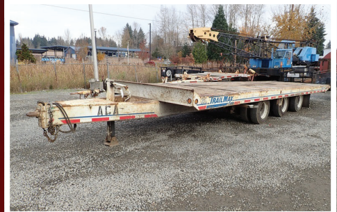
2008 TRAIL MAX TRD-54-T