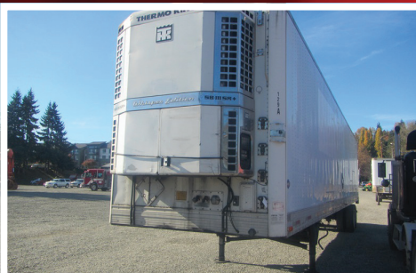
2000 UTILITY VS2R