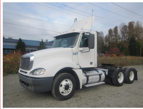
2007 FREIGHTLINER COLUMBIA