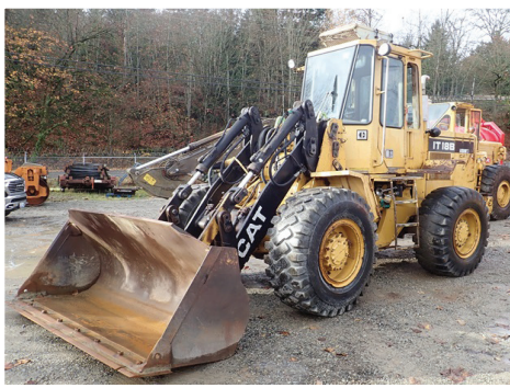
1988 CAT IT18B