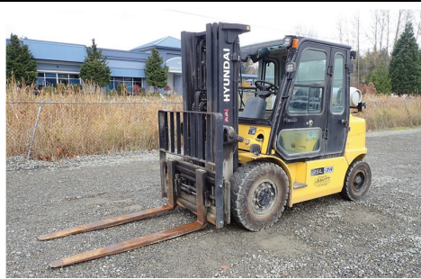
2010 HYUNDAI 35L-7A