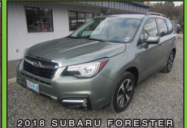
2018 SUBARU FORESTER