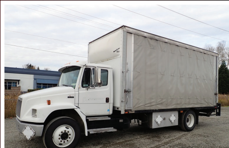
2002 FREIGHTLINER FL70