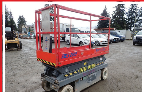
2000 SKYJACK SJ3/3220

1.800.426.3008 - 425.486.1246 - murphyauction.com