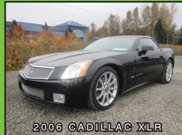
2006 CADILLAC XLR