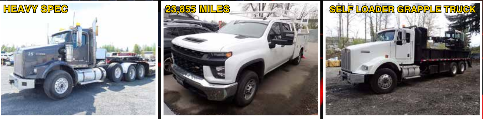
2017 KENWORTH T800