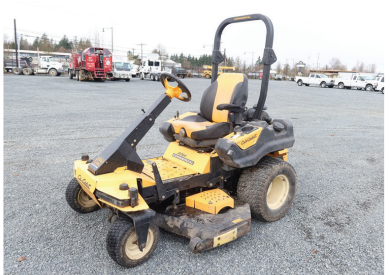
2014 CLUB CADET ANK