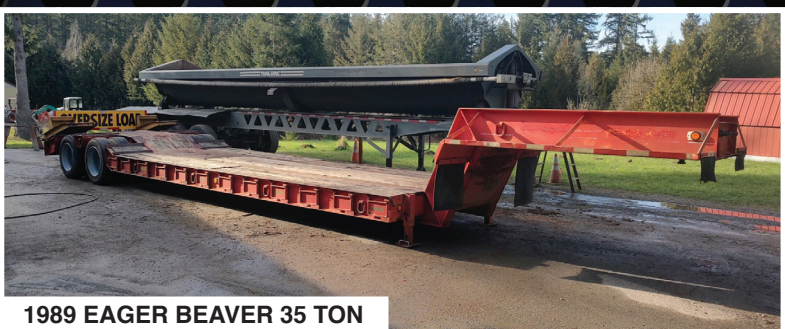
1993 INTERNATIONAL 8100