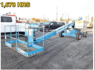
1998 GENIE S-40