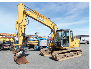
2006 JOHN DEERE 120CLC