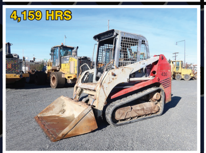
2003 TAKEUCHI TL130