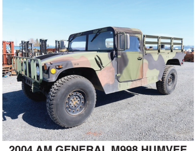
2004 AM GENERAL M998 HUMVEE