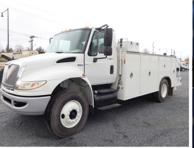
2008 INTERNATIONAL 4400