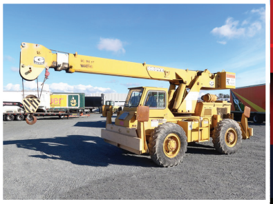
1978 GROVE RT58