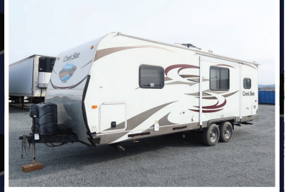
2013 CREEK SIDE 23 RKS