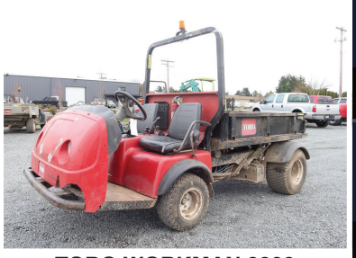
TORO WORKMAN 3200