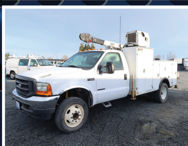
2001 FORD F550