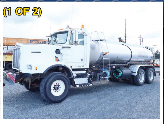
1989 KENWORTH C500B