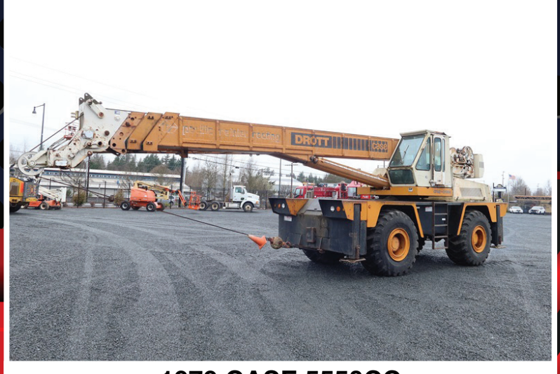
1979 CASE 5550CC