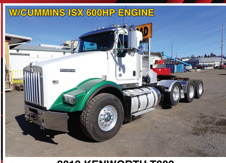
2013 KENWORTH T800