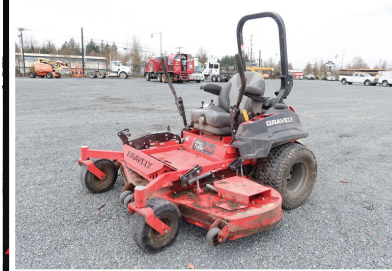
GRAVELY PRO TURN 272