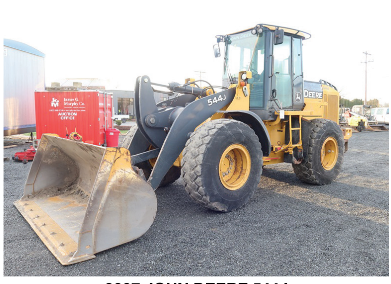
2007 JOHN DEERE 544J