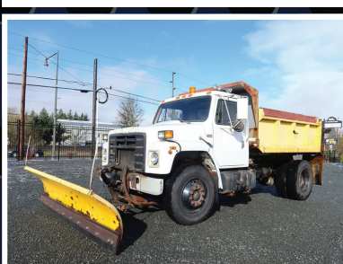
1985 INTERNATIONAL S1700