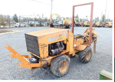
1989 CASE MAXI SNEAKER