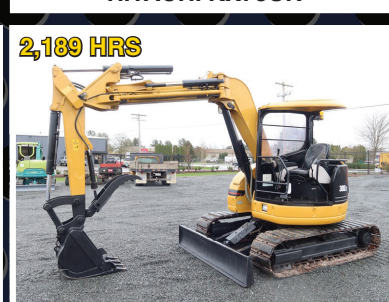
2003 CAT 305SR