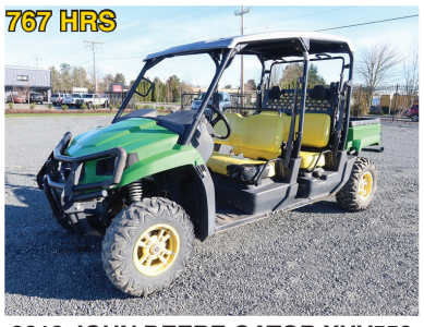
2013 JOHN DEERE GATOR XUV550