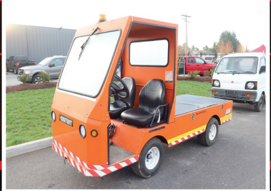
2018 TAYLOR DUNN BIGFOOT