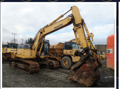
2004 KOMATSU PC308