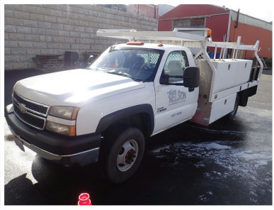
2007 CHEV 3500