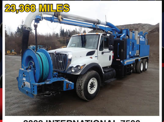
2009 INTERNATIONAL 7500