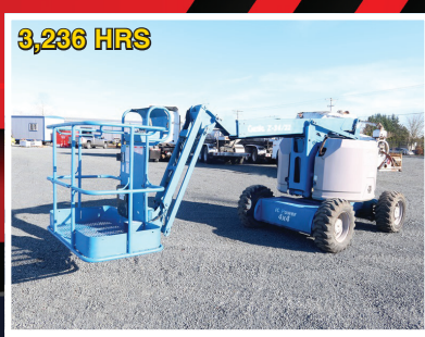
2007 GENIE Z-34/22