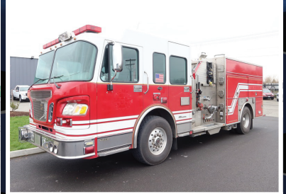
2004 SPARTAN GLADIATOR