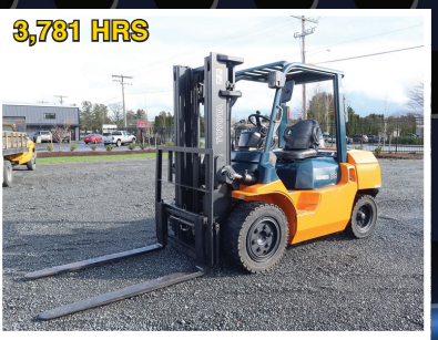
2008 TOYOTA 7FD35