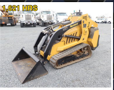
2018 VERMEER S925TX