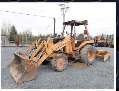
1985 CASE 580 SUPER E