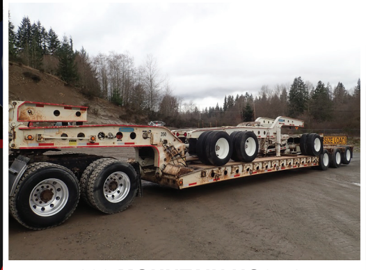
1999 MOUNTAIN HG65-3