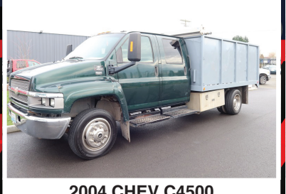
2004 CHEV C4500