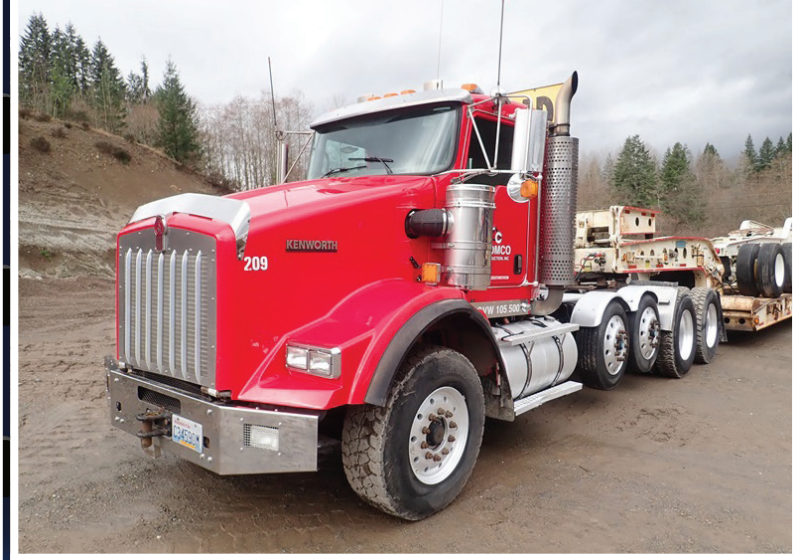
2007 KENWORTH T800