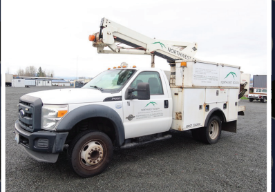
2013 FORD F550