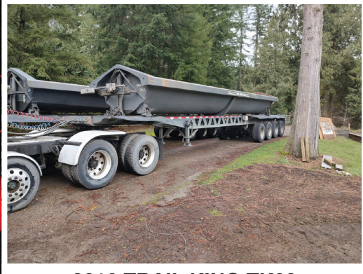
2016 TRAIL KING TK60