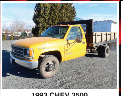
1993 CHEV 3500