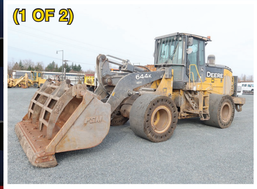
2016 JOHN DEERE 644K