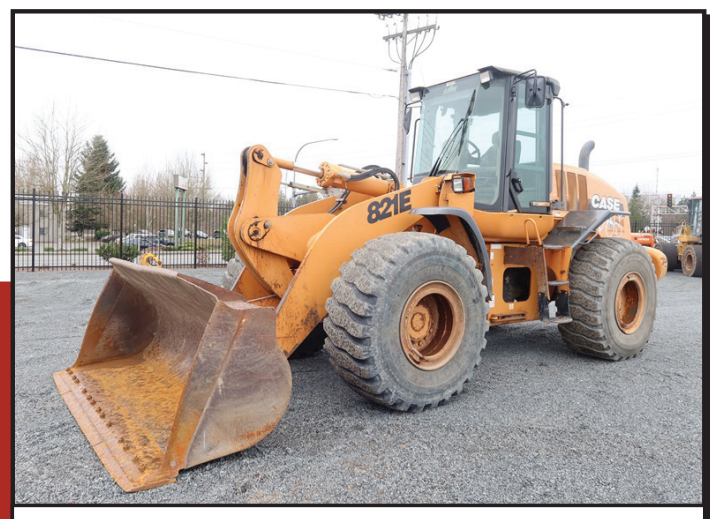
2007 CASE 821E