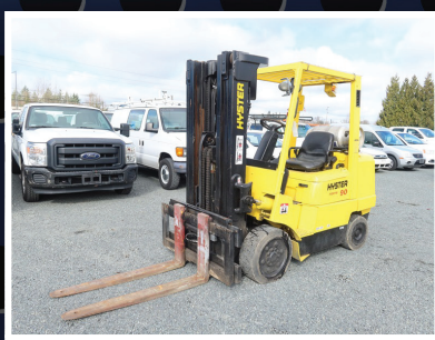
2005 HYSTER S80XM