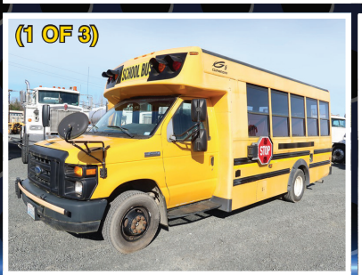
2009 FORD E450