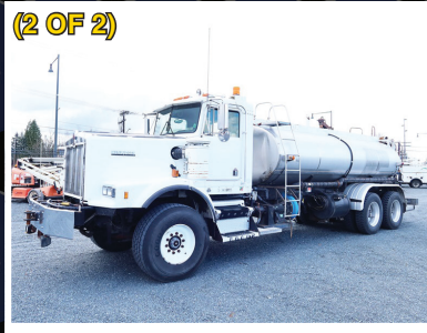
1989 KENWORTH C500B