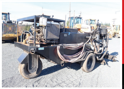
SEAL COAT BUGGY