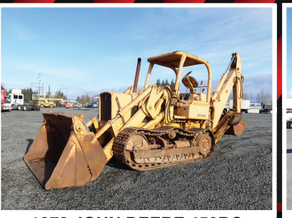
1973 JOHN DEERE 450BC