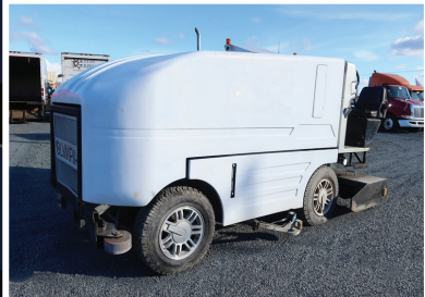
OLYMPIA 2001 MILLENNIUM