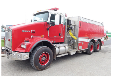
2003 KENWORTH T800B