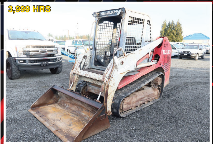
2004 TAKEUCHI TL130