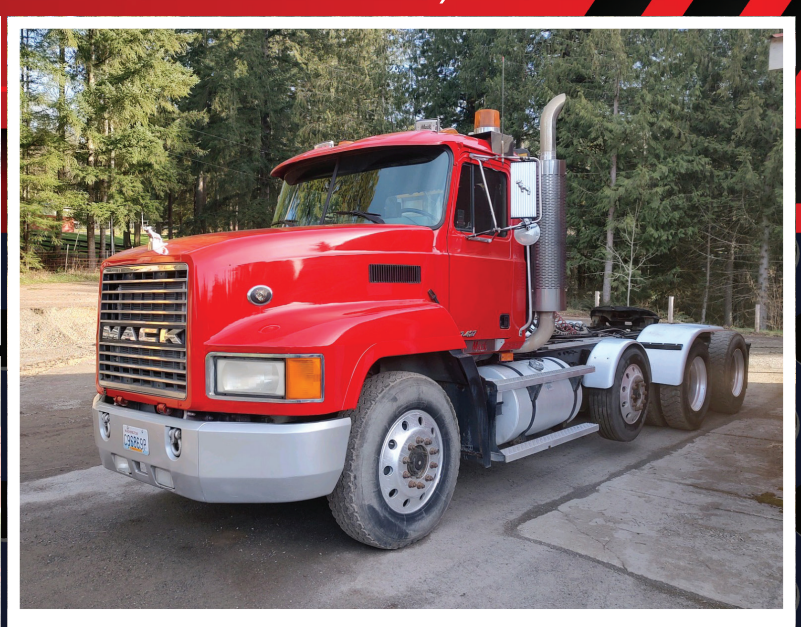
1996 MACK CH613