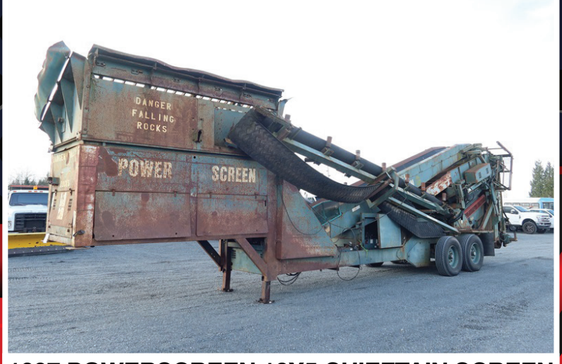
1997 POWERSCREEN 10X5 CHIEFTAIN SCREEN