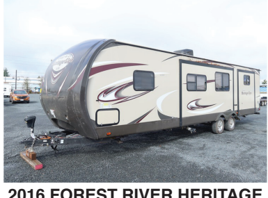
2016 FOREST RIVER HERITAGE