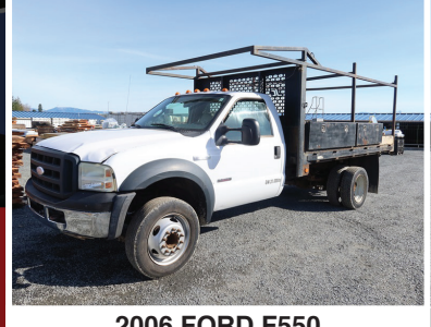
2006 FORD F550