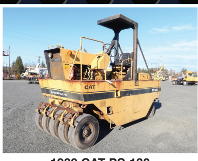
1989 CAT PS-130