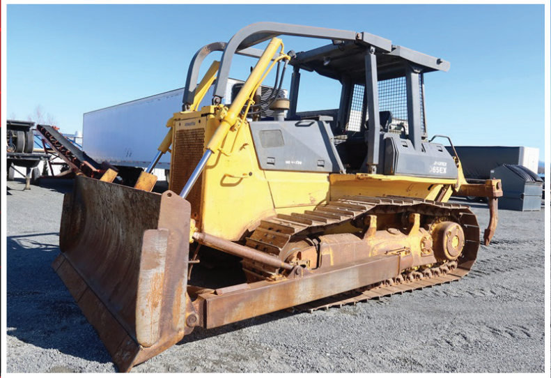
1998 KOMATSU D65E-12