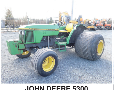
JOHN DEERE 5300