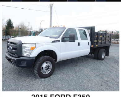
2015 FORD F350