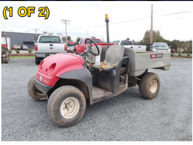
TORO WORKMAN 1110