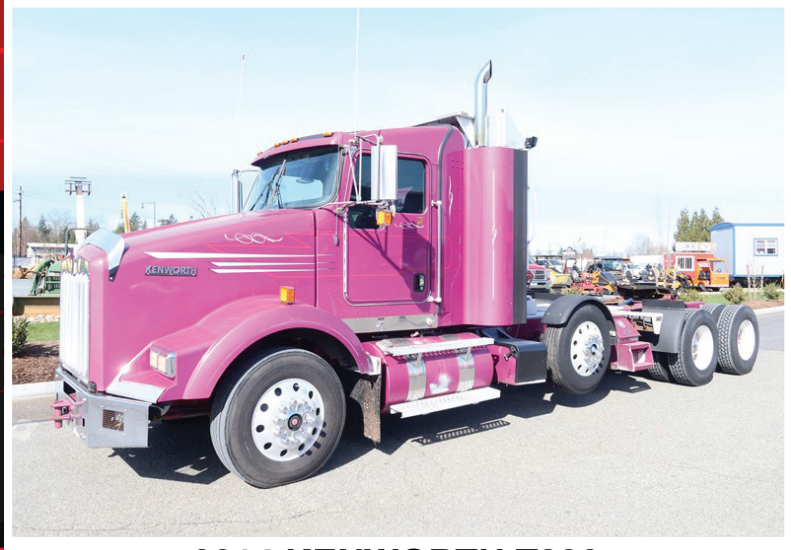
2014 KENWORTH T800