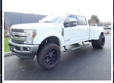
2019 FORD F350