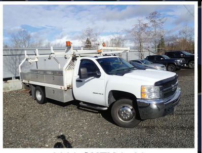
2008 CHEV 3500