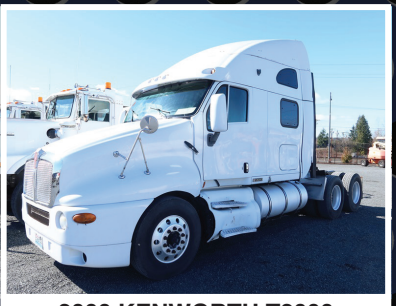
2000 KENWORTH T2000