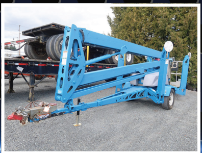
2005 GENIE TZ50