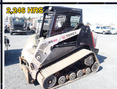
2012 TEREX PT80