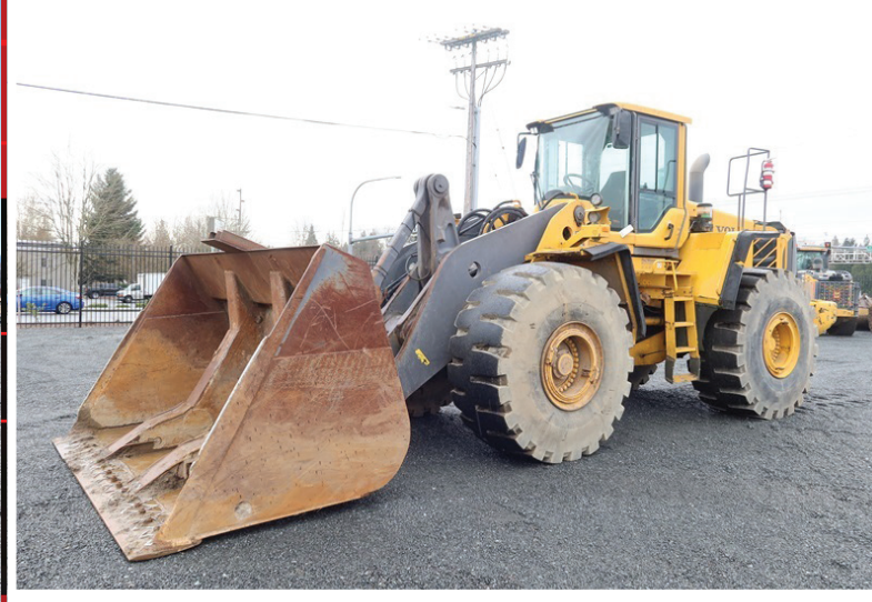
2008 VOLVO L220F