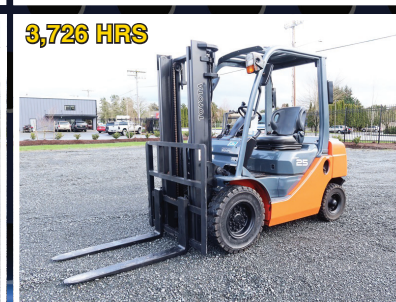
2012 TOYOTA 8FD25