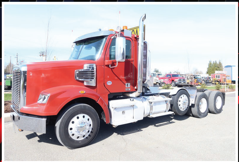
2015 FREIGHTLINER CORONADO