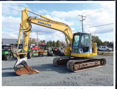
2004 KOMATSU PC138