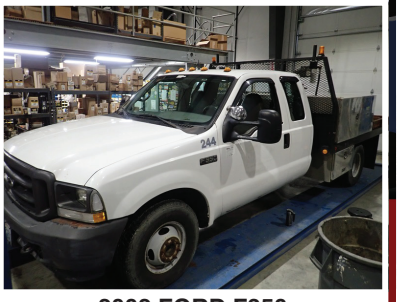
2002 FORD F350