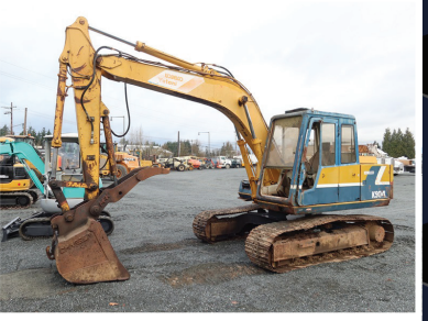
1989 KOBELCO K904