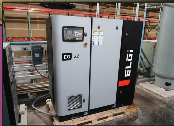
2020 ELGI EG-22-125V