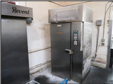
AMERICAN PANEL AP20BCF175-3