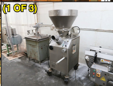
VEMAG ROBOT 500