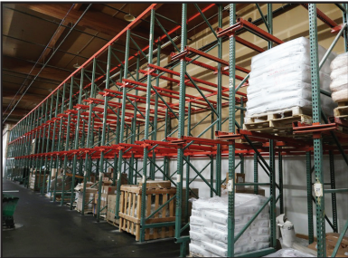
(36) SECTIONS OF 24' PALLET RACKING