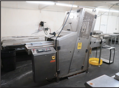
2006 UBE 90-75