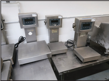
LARGE ASSORTMENT OF SCALES