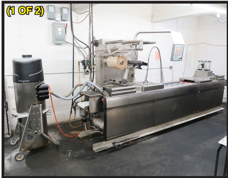
2008 & 2013 MULTIVAC R145