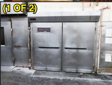
LBC BAKERY EQUIPMENT LRP3